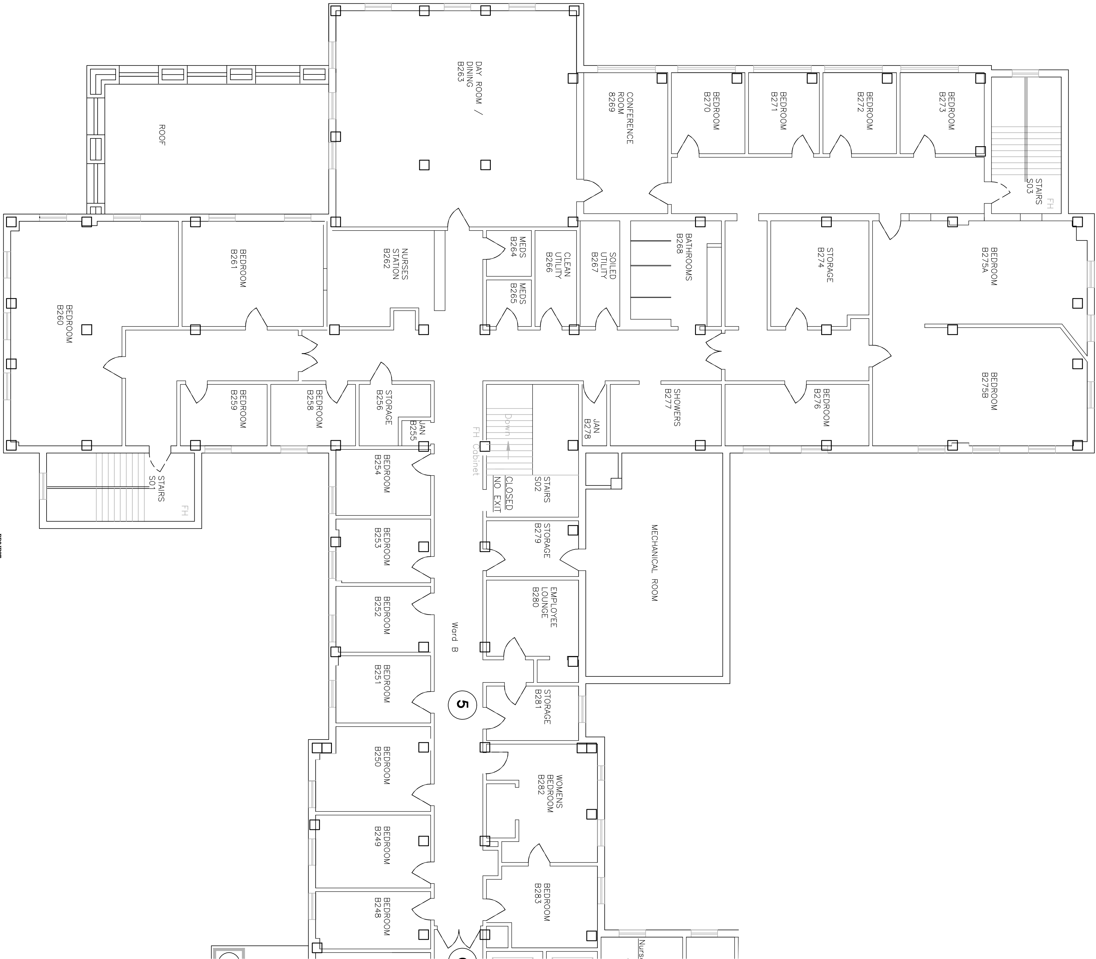
1 SECOND FLOOR PLAN 1/8" = 1'-0"