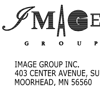
IMAGE GROUP INC. Architecture & Interiors MEN ENGINEERING, Electrical Engineers

Dept. of Veterans Affairs Medical Center 2101 Elm Street North Fargo, ND 58102