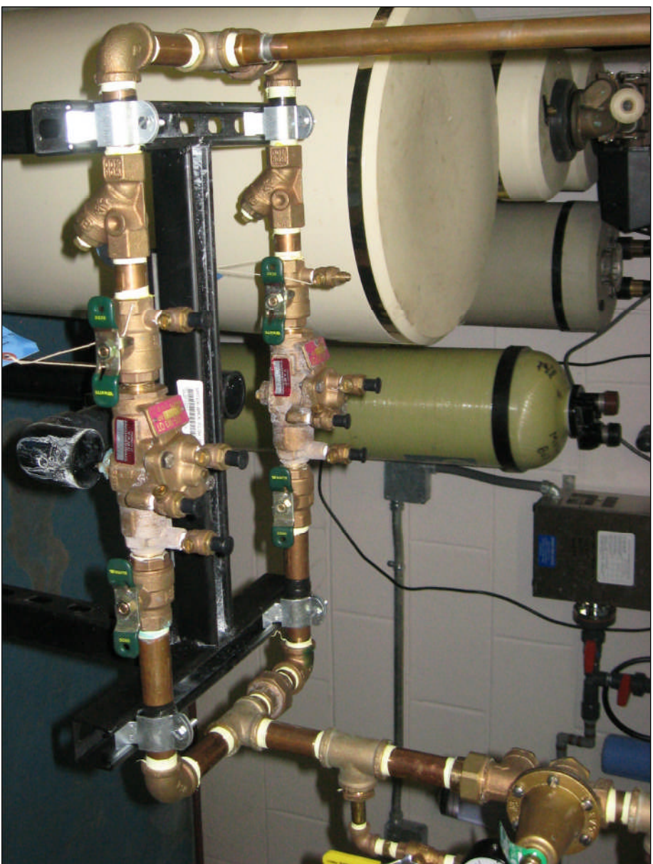
VIEW 2 - BACKFLOW PREVENTERS AT R.O. SYSTEM