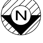
ELECTRICAL NEW WORK FLOOR PLAN - BLDG. 1S SCALE: 1/16" = 1' - 0"