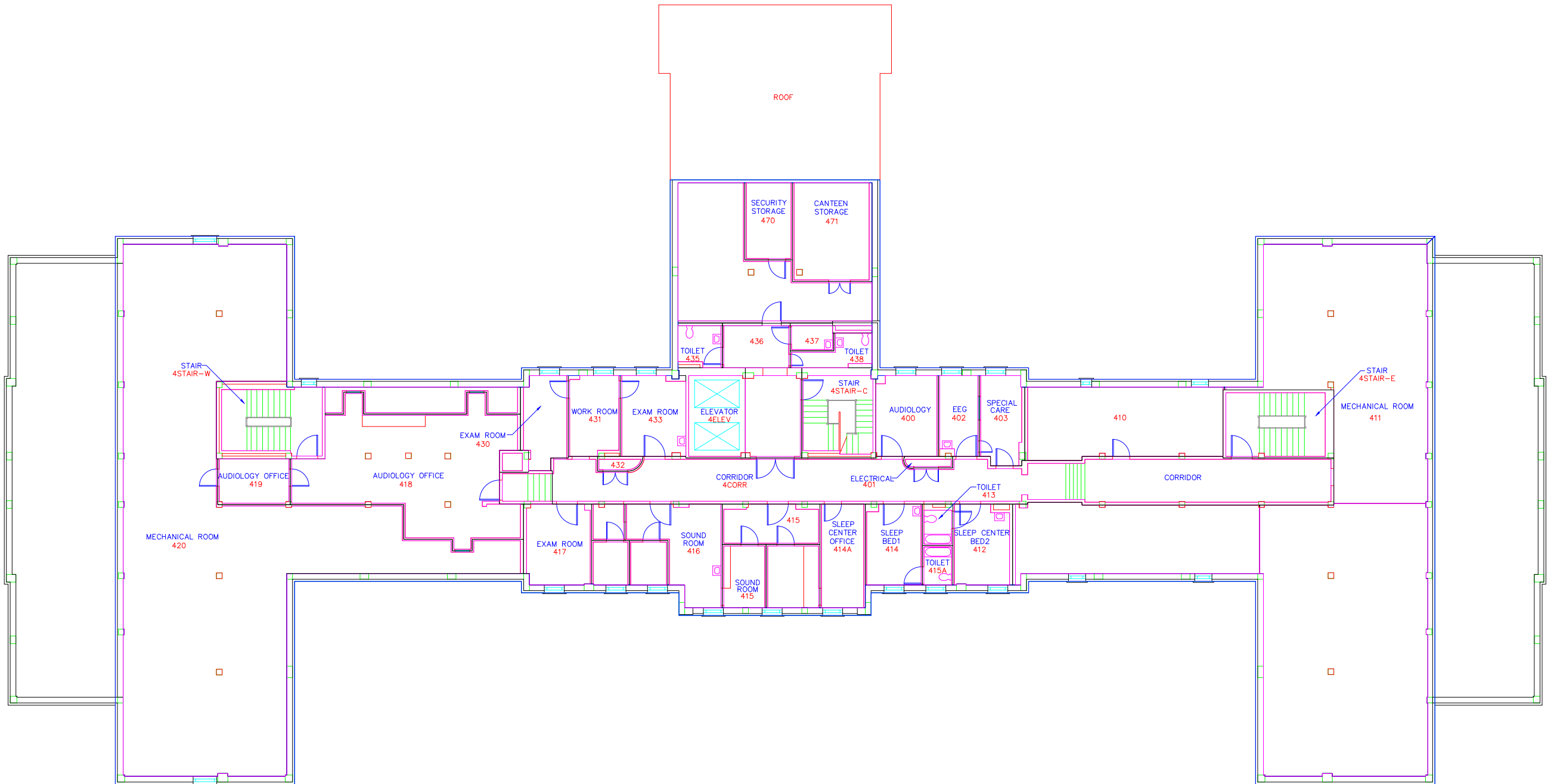
BUILDING 1, FLOOR 4