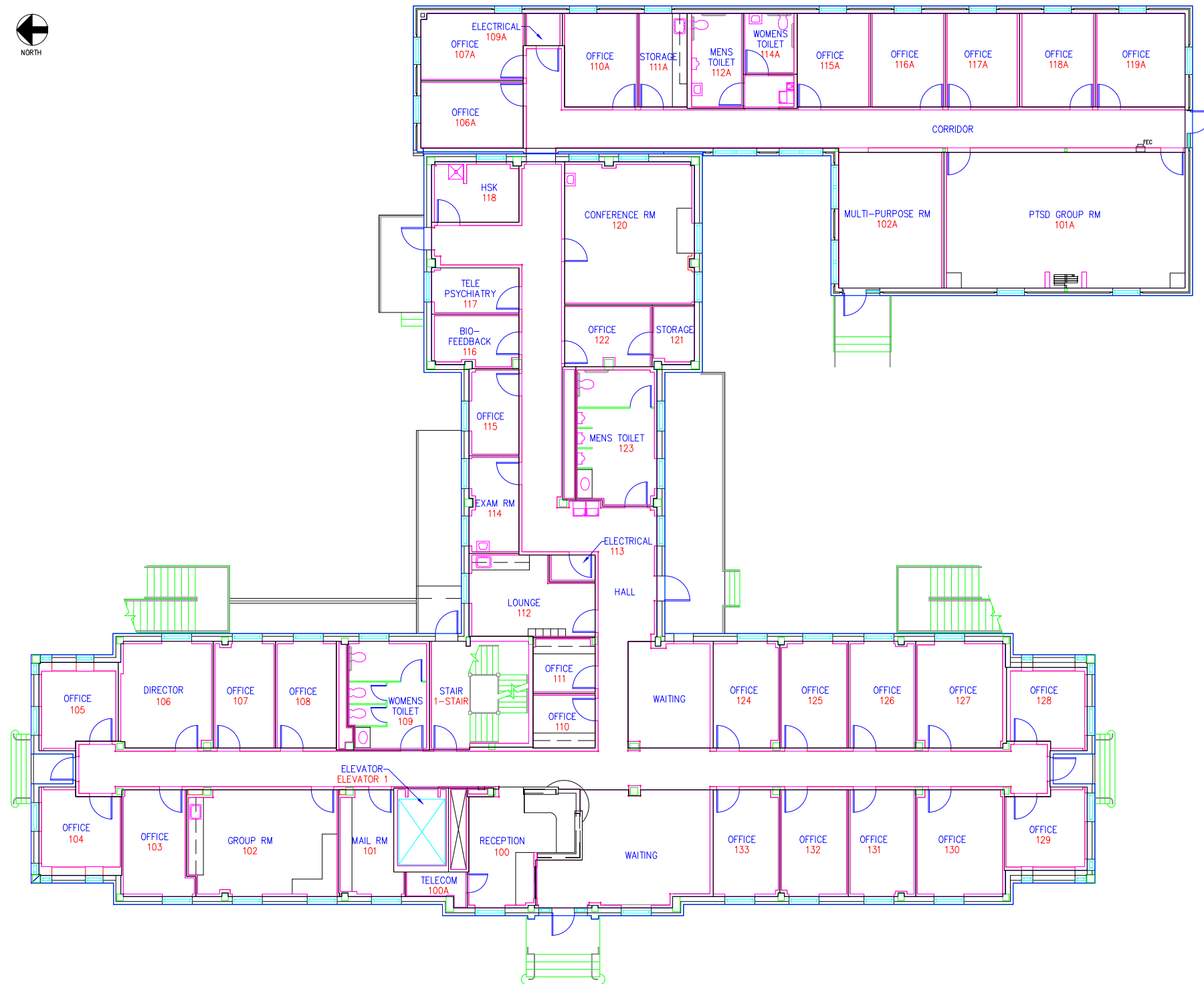
BUILDING 5, FLOOR 1