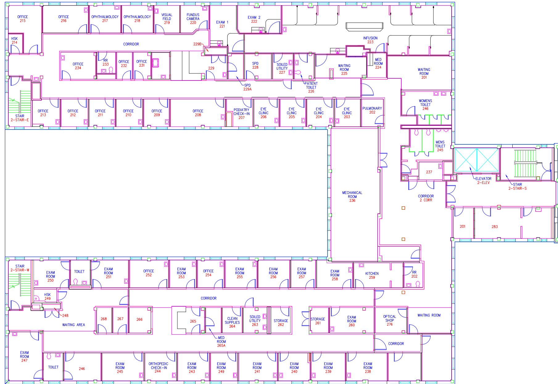
BUILDING 26, FLOOR 2