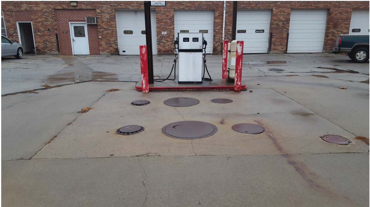
Tanks 9 & 10