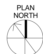
3 DOME REINF. PLAN 1/4" = 1'-0"

CONSTRUCTION DOCUMENTS 1 FULLY SPRINKLERED