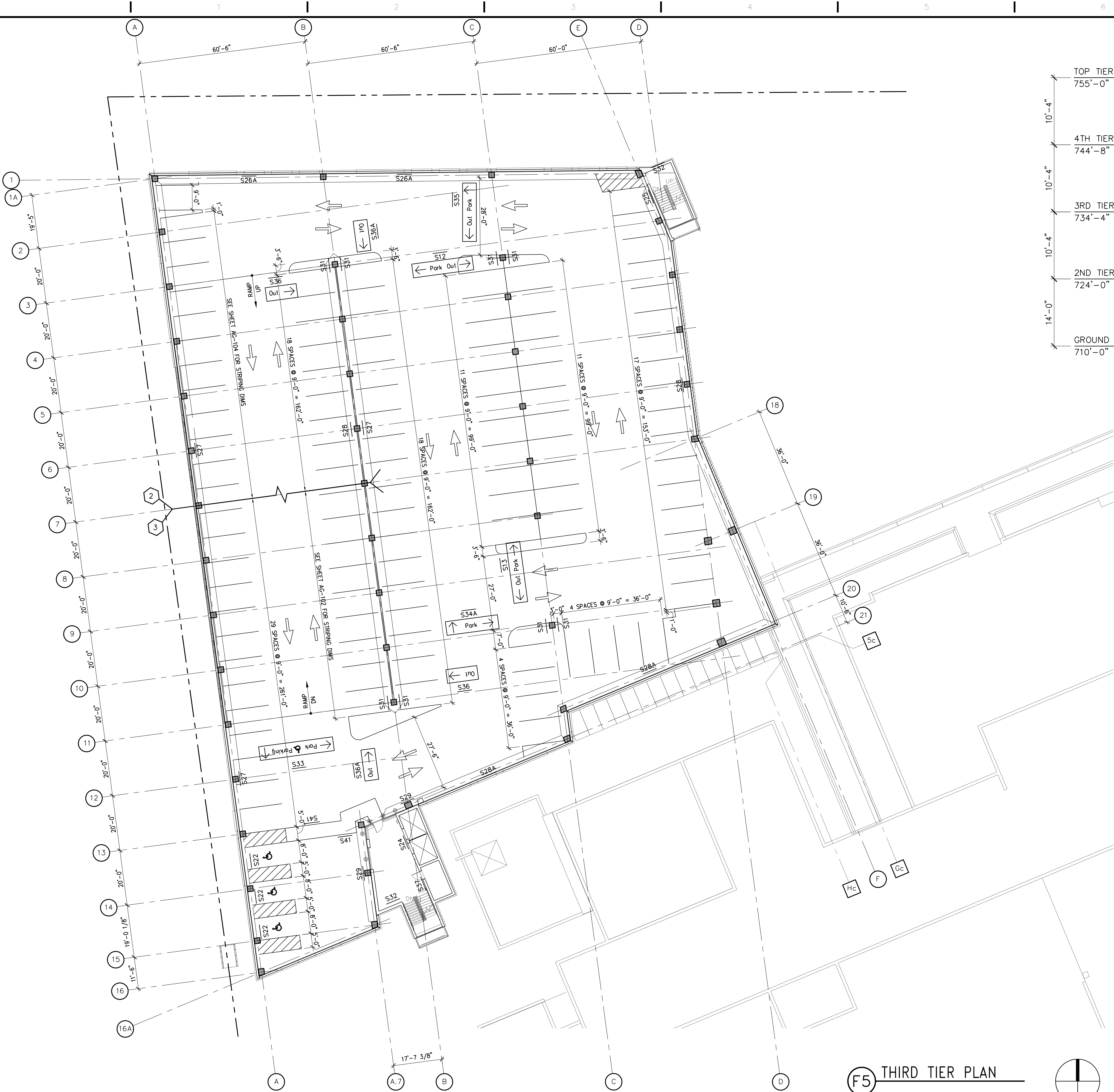
F5 THIRD TIER PLAN