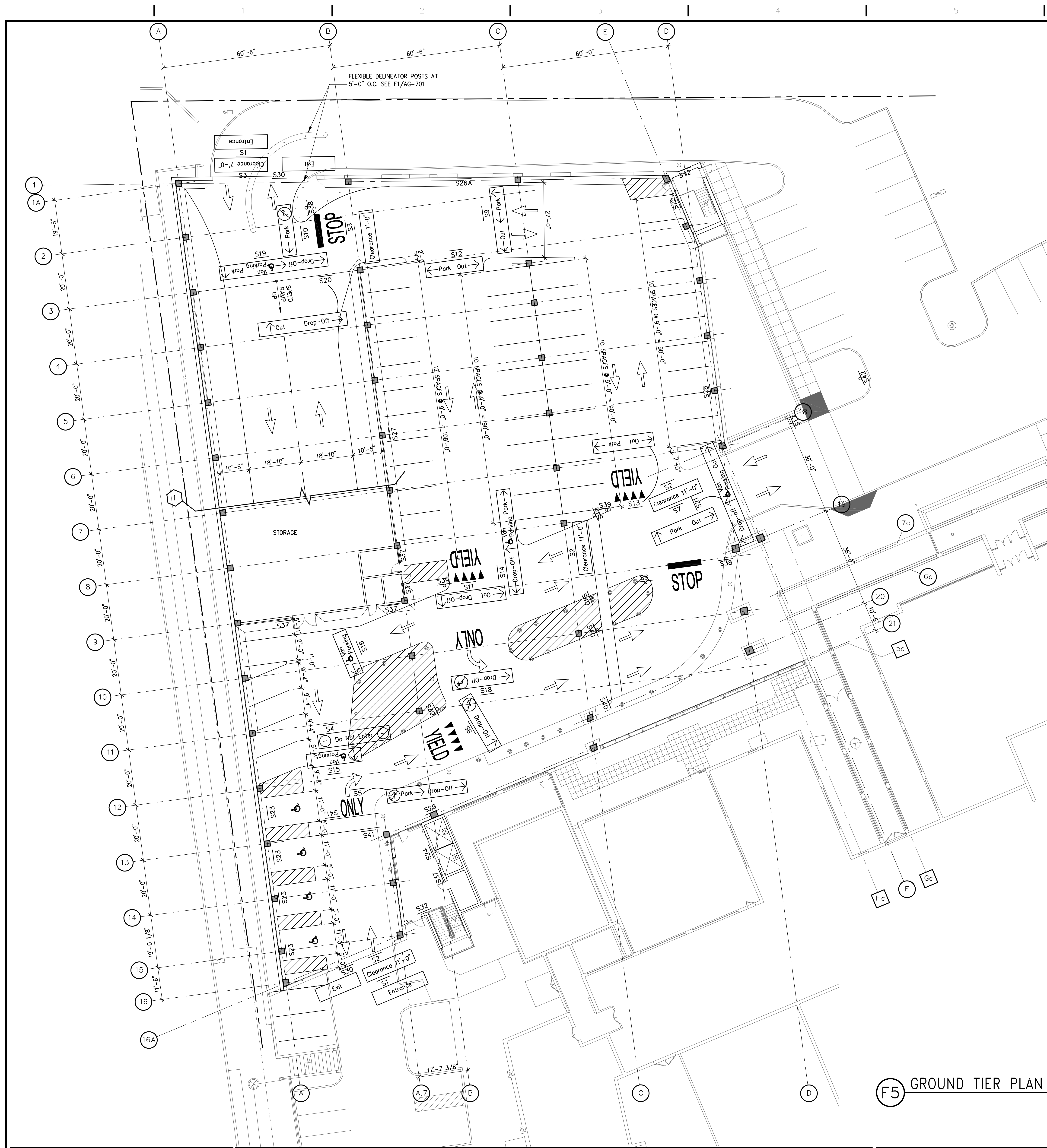
F5 GROUND TIER PLAN