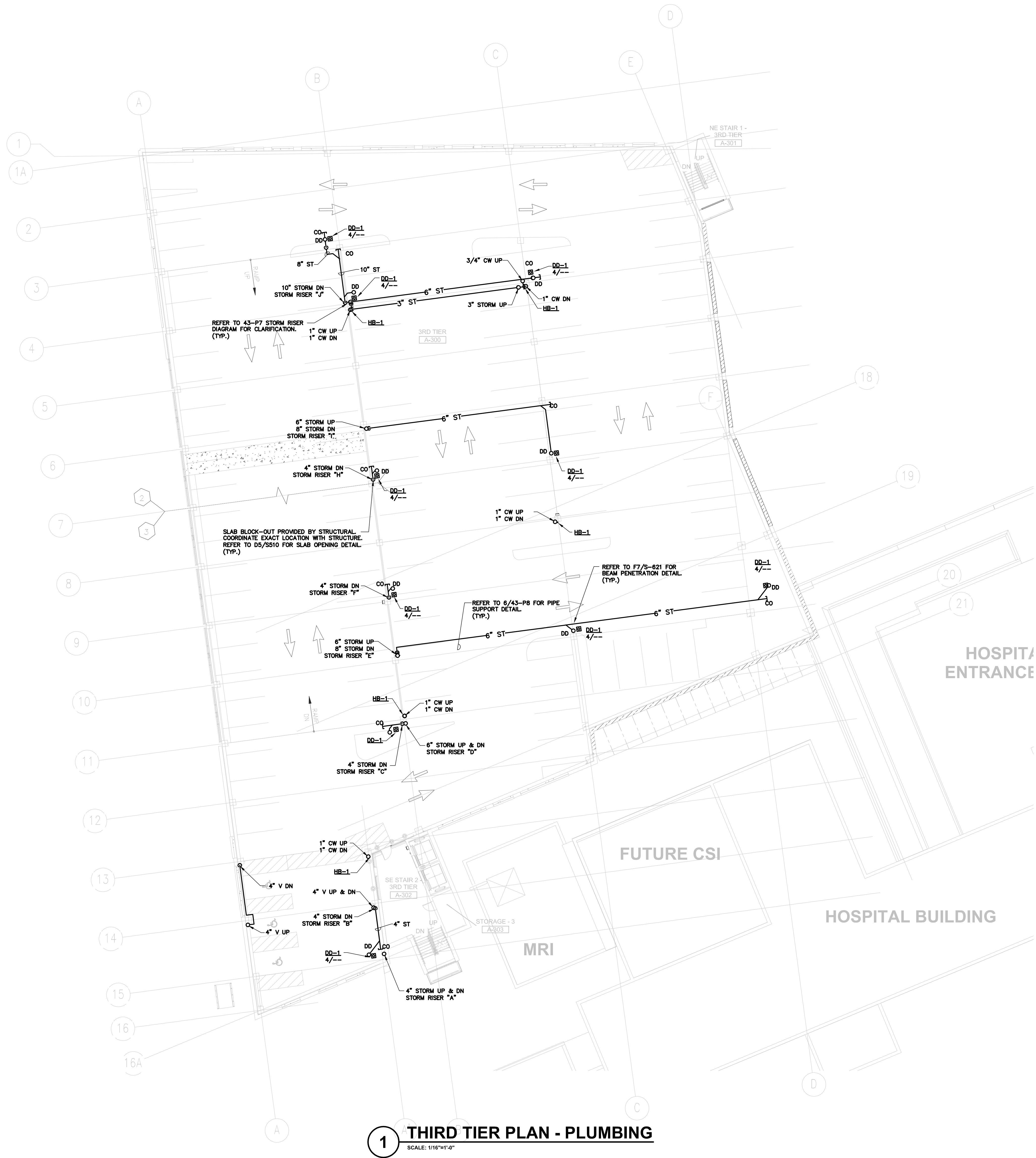
1 THIRD TIER PLAN - PLUMBING SCALE: 1/16"=1'-0"