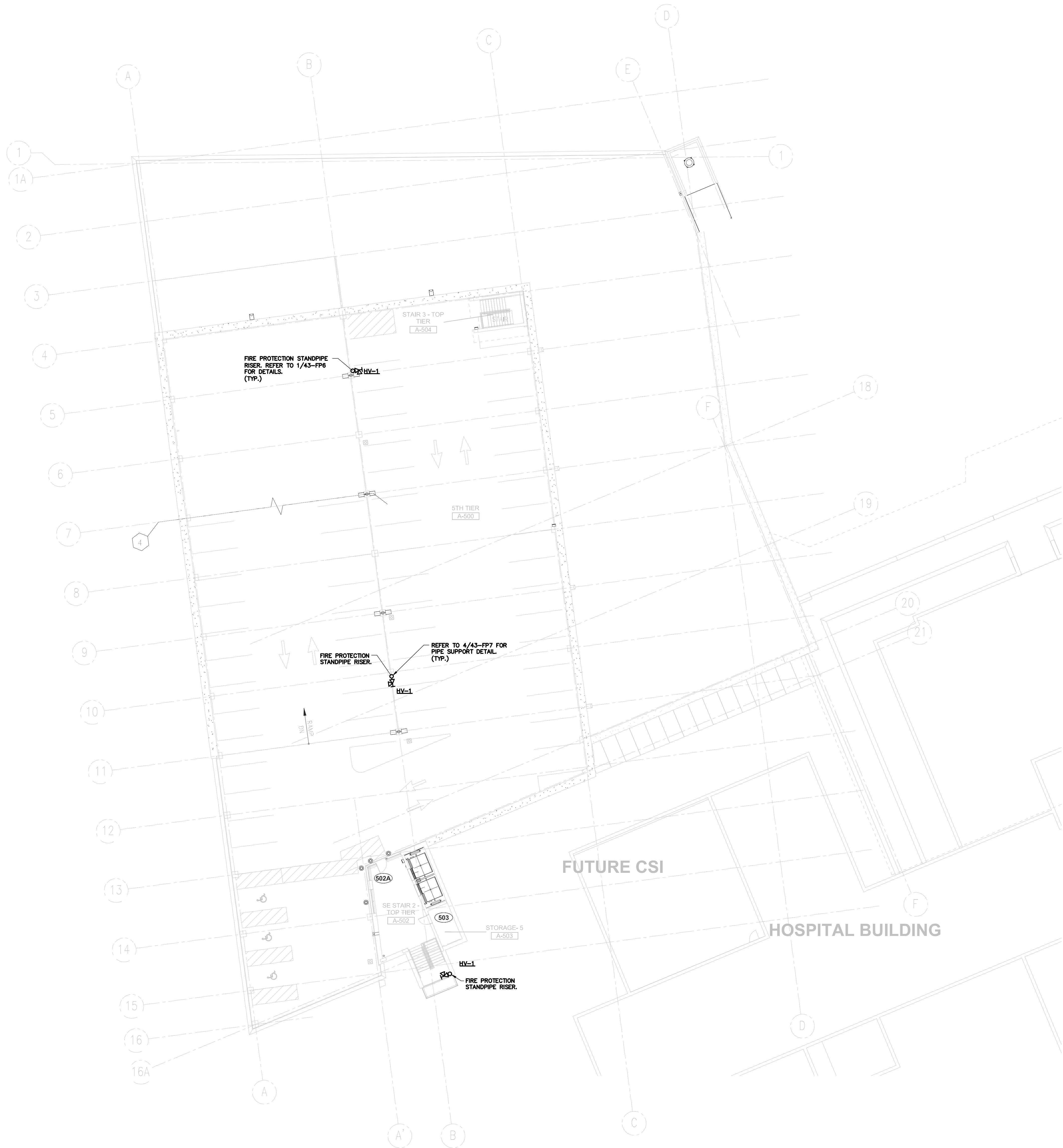
1 TOP TIER PLAN - FIRE PROTECTION SCALE: 1/16"=1'-0"