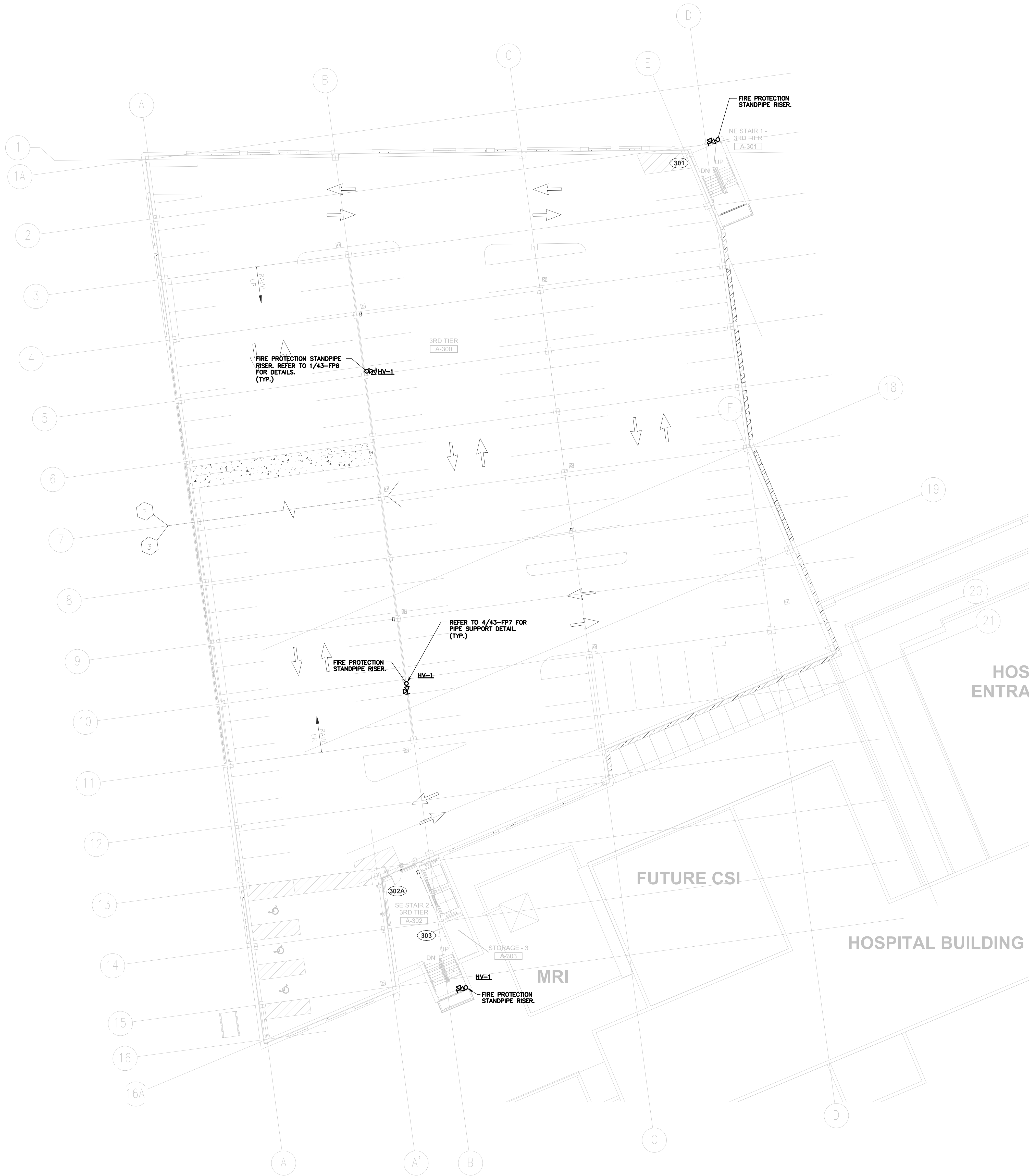
1 THIRD TIER PLAN - FIRE PROTECTION SCALE: 1/16"=1'-0"

one eighth inch = one foot one quarter inch = one foot three eighths inch = one foot one half inch = one foot three quarters inch = one foot one inch = one foot one and one half inches = one foot two inches = one foot three inches = one foot