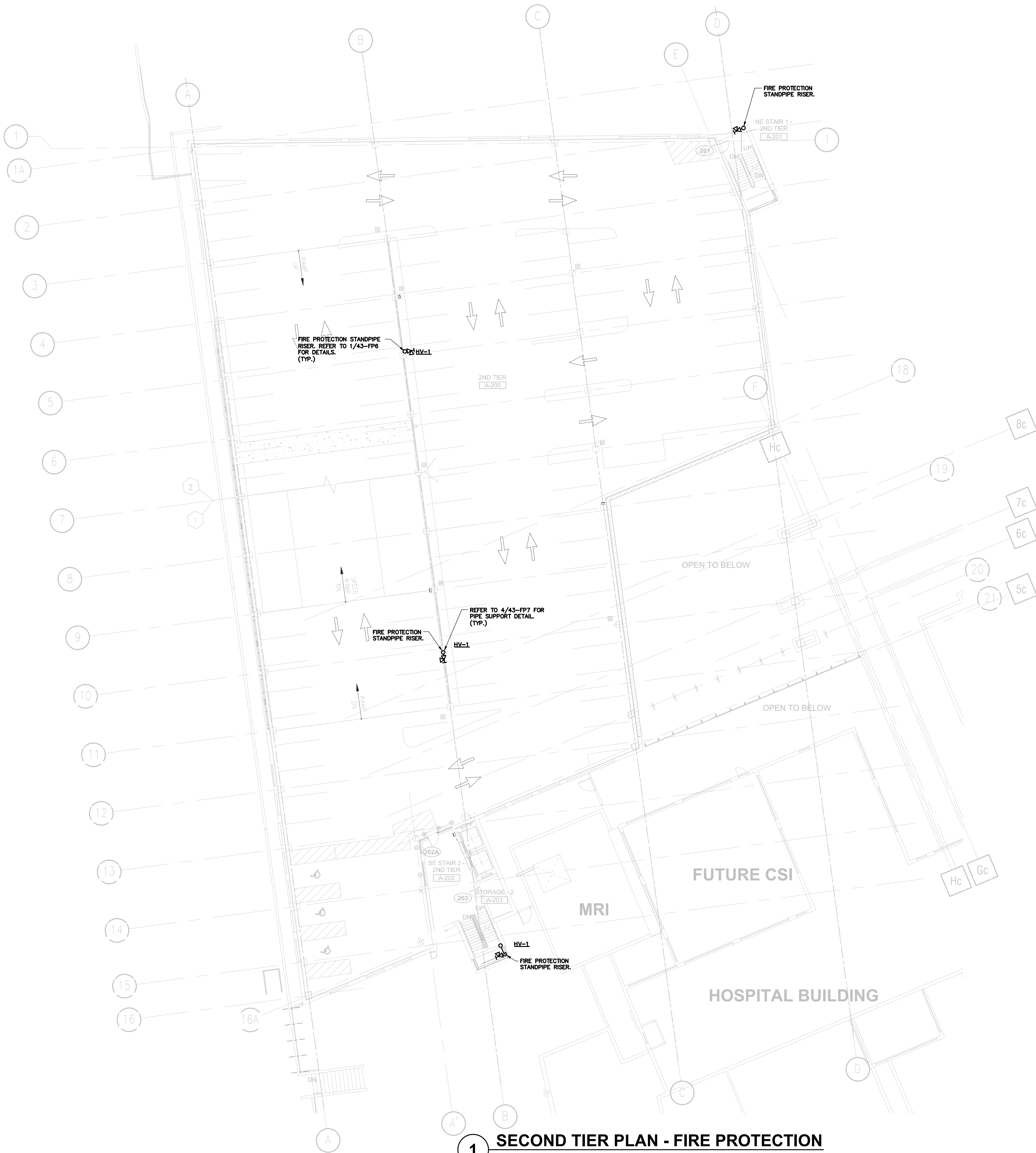
1 SECOND TIER PLAN - FIRE PROTECTION SCALE: 1/16"=1'-0"

one eighth inch = one foot one quarter inch = one foot three eighths inch = one foot one half inch = one foot three quarters inch = one foot one inch = one foot one and one half inches = one foot two inches = one foot three inches = one foot