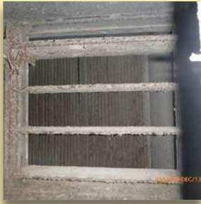
Open after repair