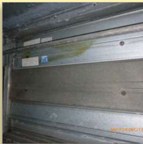
Closed after repair