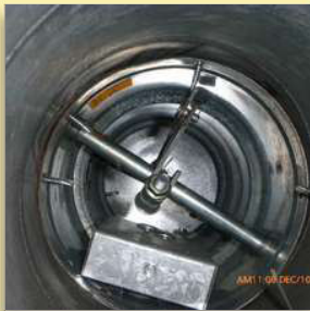
Re-opened after repair