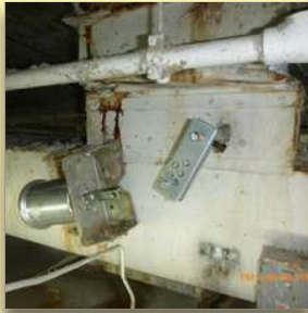
Open after repair