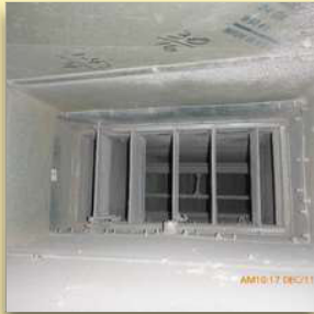
Open after repair