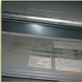
Open after repair