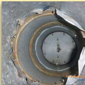
Closed after repair