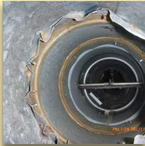
Open after repair