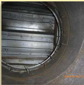
Closed after repair