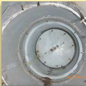
Closed after repair