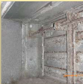
Closed after repair