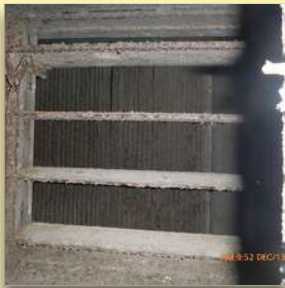
Re-opened after repair