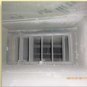
Re-opened after repair