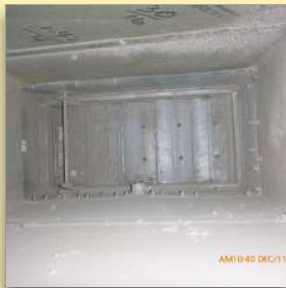
Closed after repair