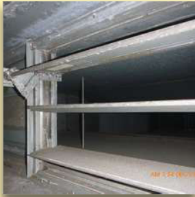
Open after repair