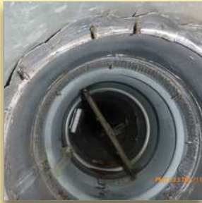
Open after repair