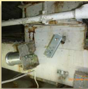
Re-opened after repair