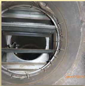
Re-opened after repair