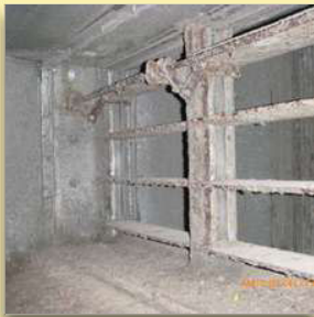
Re-opened after repair