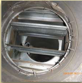
Open after repair