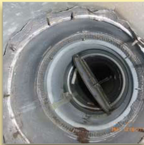
Re-opened after repair