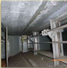
Open after repair