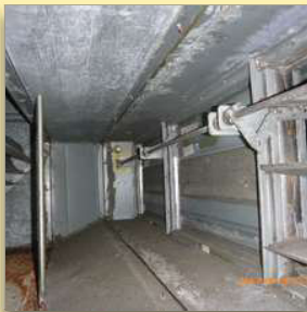
Closed after repair