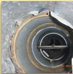
Re-opened after repair