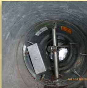
Re-opened after repair