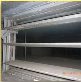
Re-opened after repair