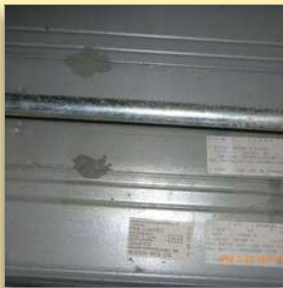
Closed after repair