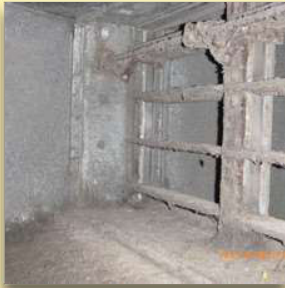
Open after repair