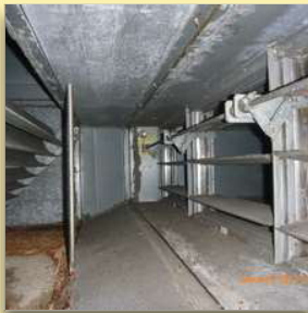
Re-opened after repair