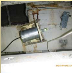
Closed after repair