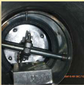
Closed after repair