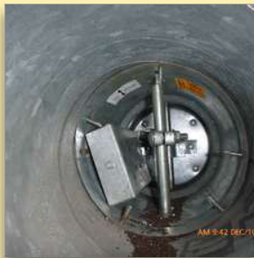
Closed after repair