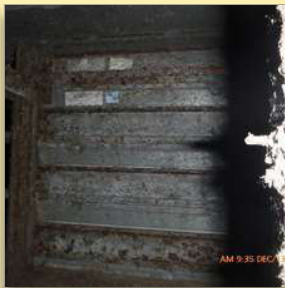
Closed after repair