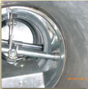
Open after repair