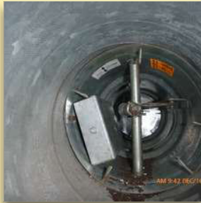
Open after repair