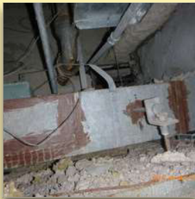
Re-opened after repair