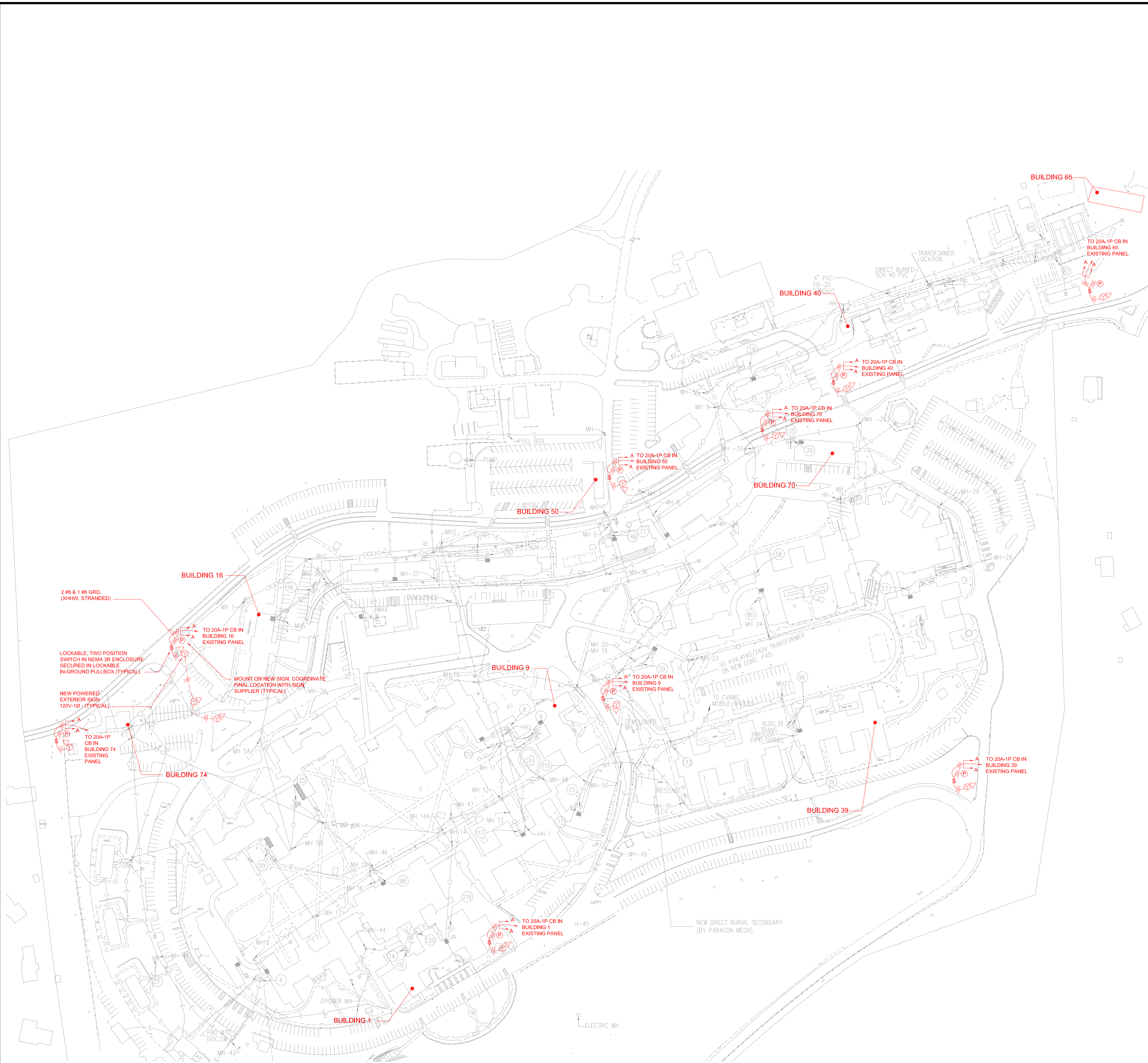
1 ELECTRICAL SITE PLAN Scale: 1"=90'