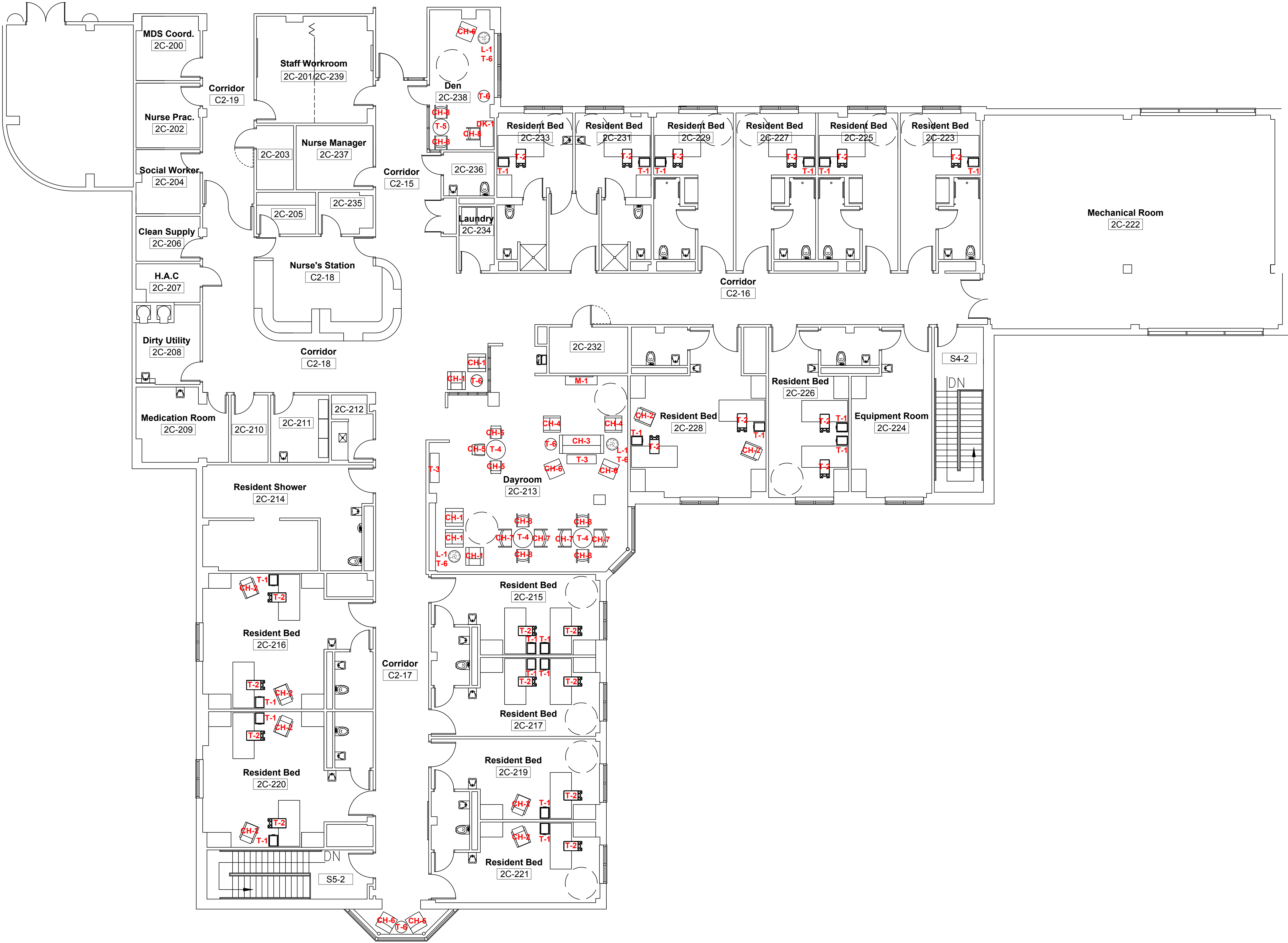
F-1 FLOOR PLAN BLDG 172, Unit 2C - VA MARION, IN CAMPUS