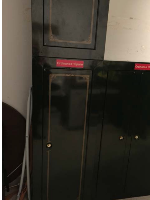
Front door from Inside