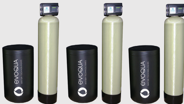
Deluxe Triplex Configuration