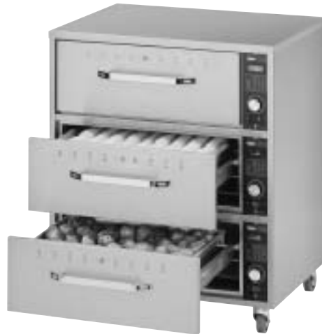
Model HDW-3 with optional casters