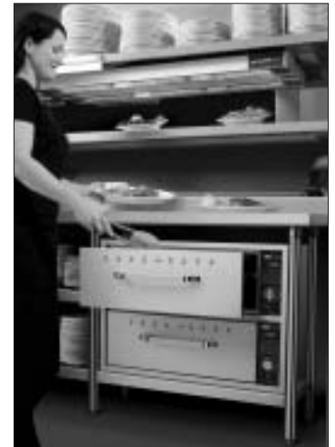
Model HDW-2 with optional stainless steel legs