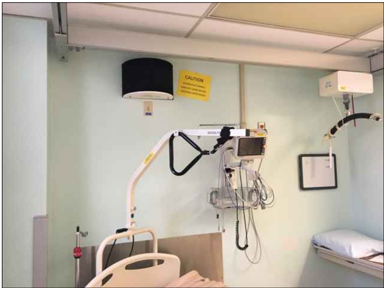
2 Existing Equipment in RM NTS