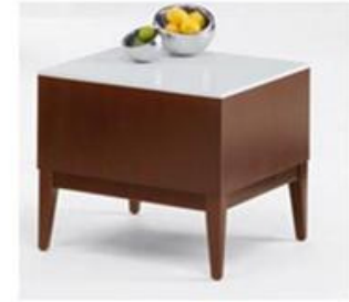
Shows Corian Top