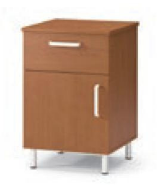
Shown with standard leg.