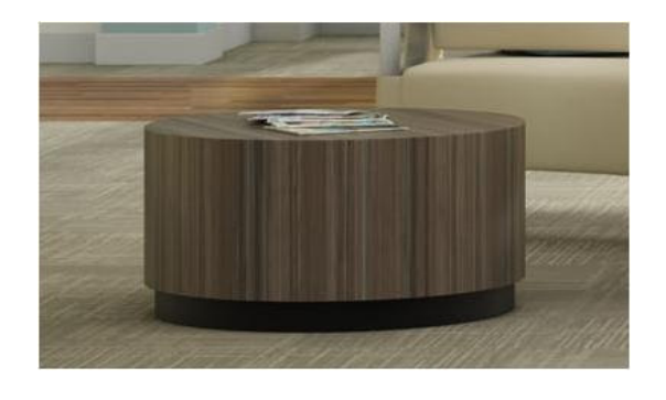
table height by three inches.

Performance Specification: Euroluxe with SilverBan on all exposed wood surfaces. Tack-In non-marring glides. Plinth increases overall