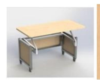
WK-01 Left Handed Workstation Configuration (6' x 6') (cont.)