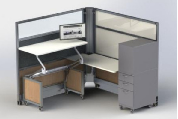
Note: Mobile Bookcase Tower at right by others. Monitor arm by others.