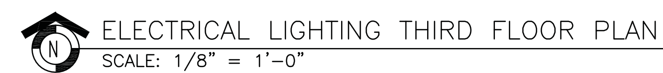
EXHIBIT "E.5" INSTALL OPERATING ROOM BOOMS PHASE 2 PROJECT NO.: 618-12-302 EXISTING THIRD FLOOR LIGHTING. PLAN

100% SUBMITTAL - CD SUBMITTAL FULLY SPRINKLERED