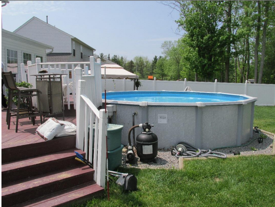
LOCATION- REAR OF HOME DESCRIPTION- LOOKING WEST, POOL TO BE REMOVED; NEW ADDITON TO THE LEFT; NEW RAMP WILL RUN PARALLEL ALONG THE REAR WALL OF THE NEW ADDITION AND END LEVEL WITH THE CONCRETE HERE