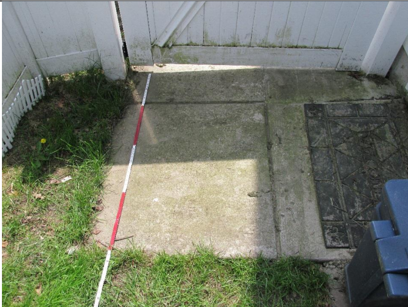
LOCATION- EAST SIDE YARD DESCRIPTION- EXISTING CONCRETE TO REMAIN AND INTEGRATED WITH NEW WALK