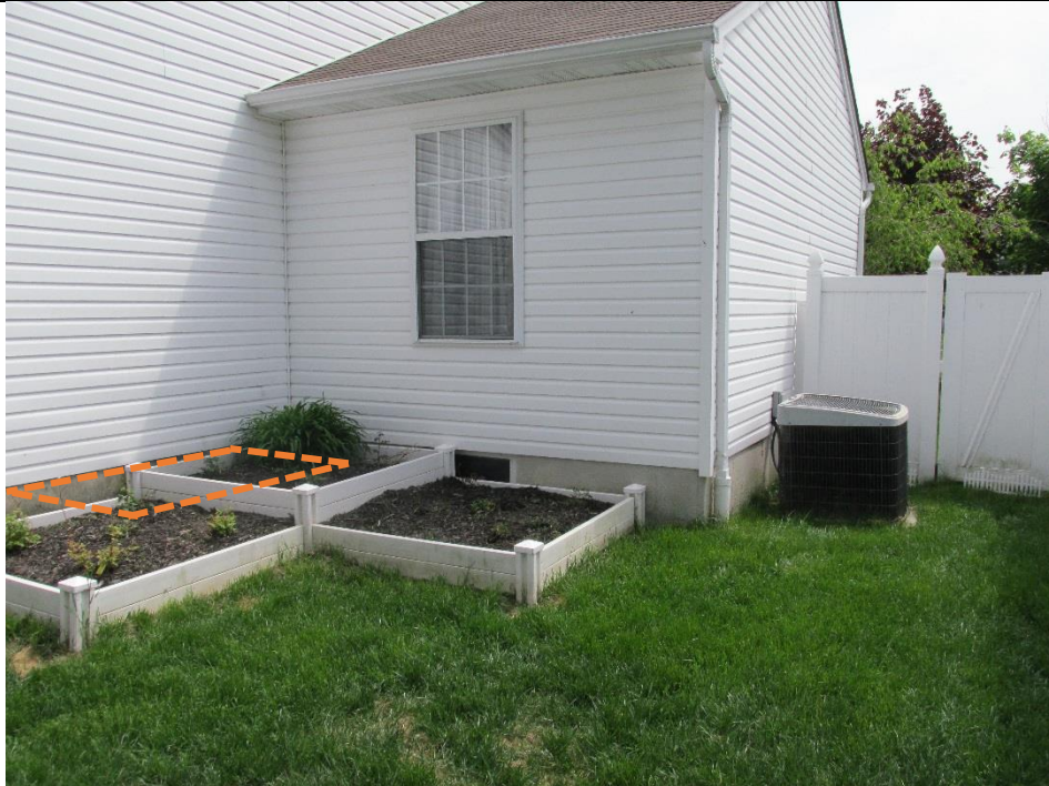
LOCATION- REAR YARD/WEST SIDE YARD DESCRIPTION- EXISTING PLANTER BOX TO BE REMOVED; APPROXIMATE LOCATION OF NEW GENERATOR SHOWN IN RED