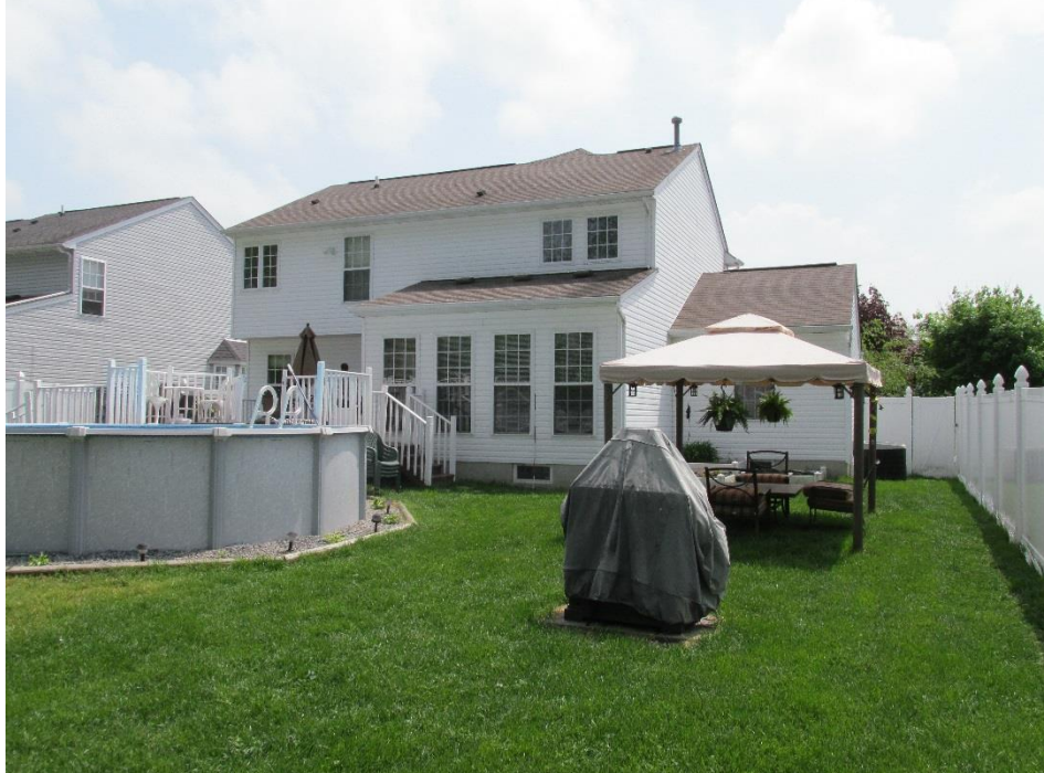
LOCATION- REAR OF HOME DESCRIPTION- LOCATION OF NEW DECK; RAMP WILL COME OFF THE SIDE OF NEW DECK ADJACENT TO NEW STAIRS AND WRAP AROUND NEW DECK AND ADDITION