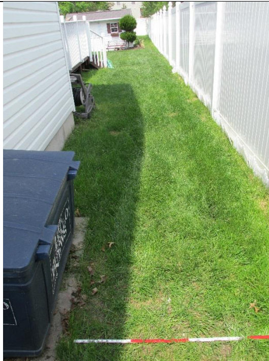
LOCATION- EAST SIDE YARD DESCRIPTION- LOCATION OF NEW CONCRETE WALK