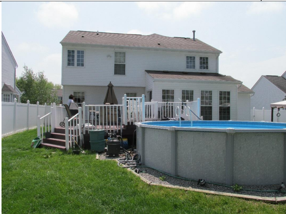
LOCATION- REAR OF HOME DESCRIPTION- FACING SOUTH