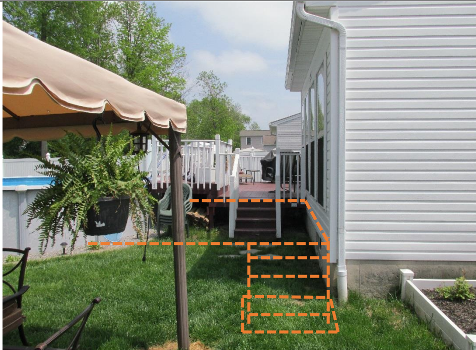
LOCATION- REAR OF BUIDILNG/ WEST SIDE YARD DESCRIPTION- APROXIMATE LOCATION OF NEW COMPOSITE STAIRS AND DECK SHOWN IN RED (NOT TO SCALE)