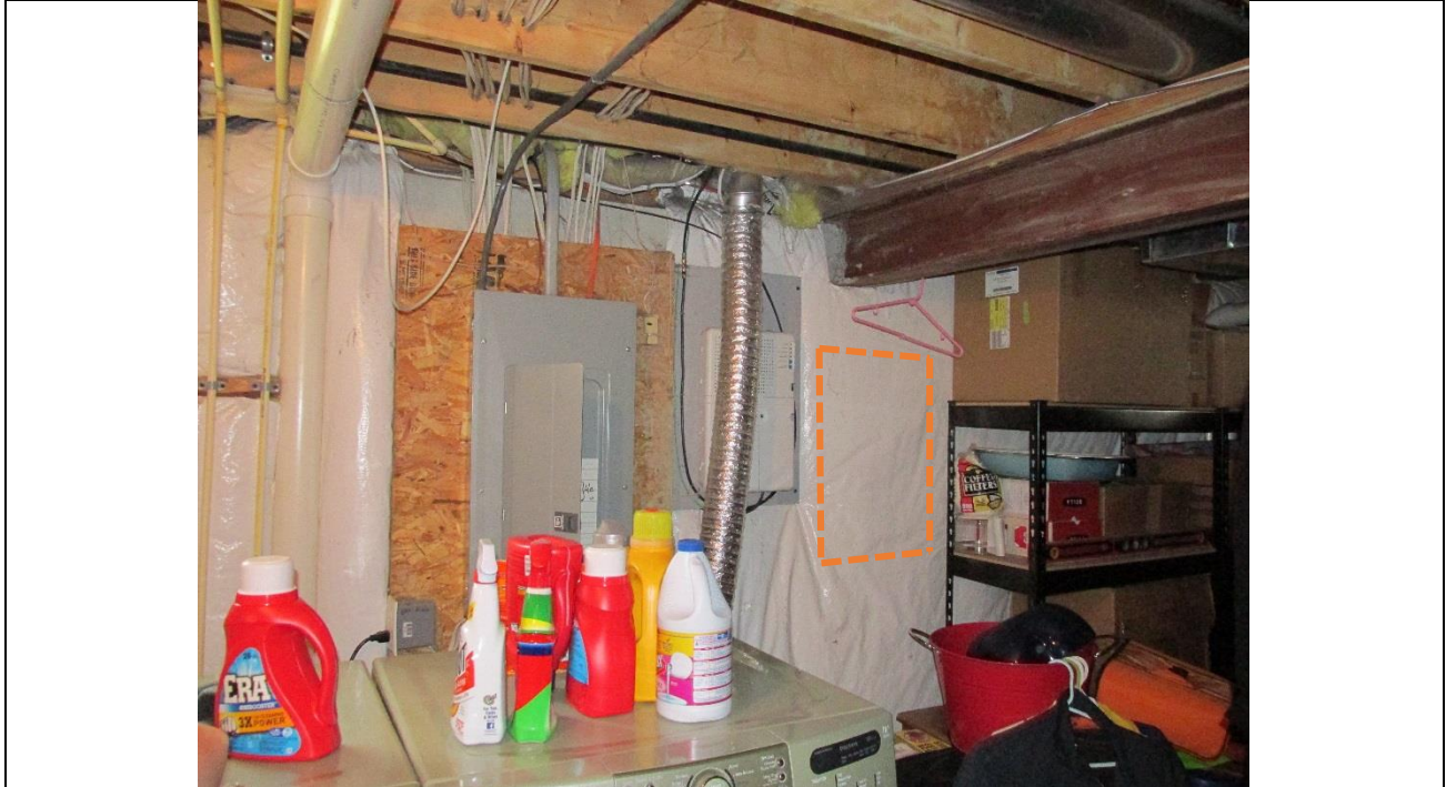
LOCATION- CELLAR DESCRIPTION- APROXIMATE LOCATION OF NEW AUTOMATIC TRANSFER SWITCH SHOWN IN RED