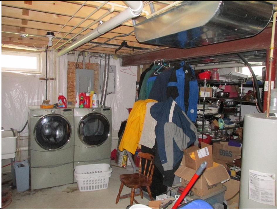
LOCATION- BASEMENT DESCRIPTION- VIEW OF EXISTING ELECTRICAL PANEL; WINDOW TO THE RIGHT WILL BE ADJACENT TO NEW GENERATOR