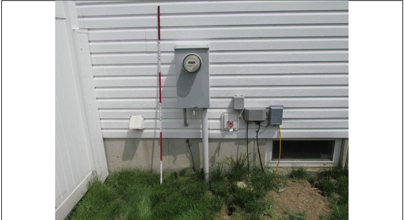
LOCATION- WEST SIDE YARD DESCRIPTION- EXISTING UNDERGROUND ELECTRICAL SERVICE