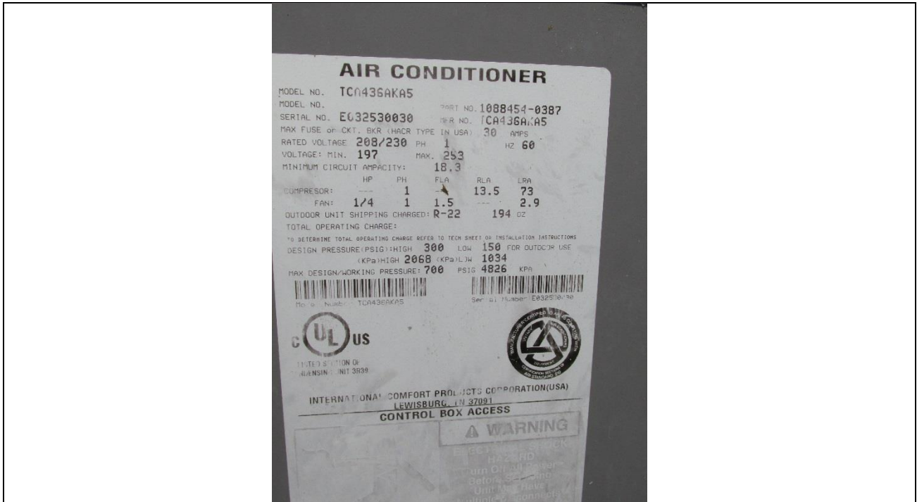
LOCATION- WEST SIDE YARD DESCRIPTION- AIR CONDITIONOR CONDENSOR LABEL