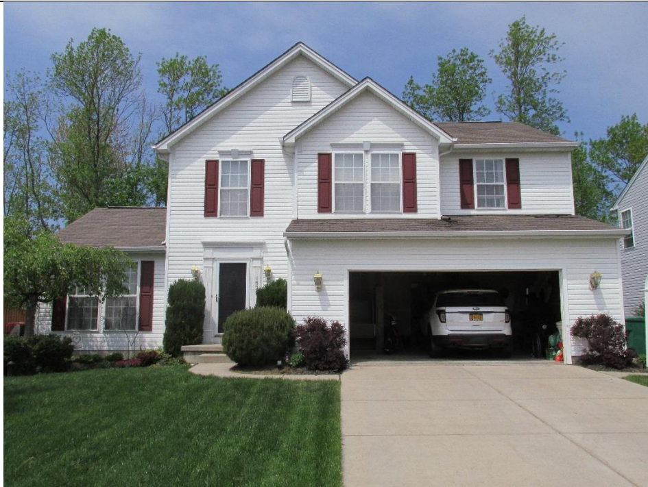
LOCATION- FRONT OF HOME DESCRIPTION- FACING NORTH