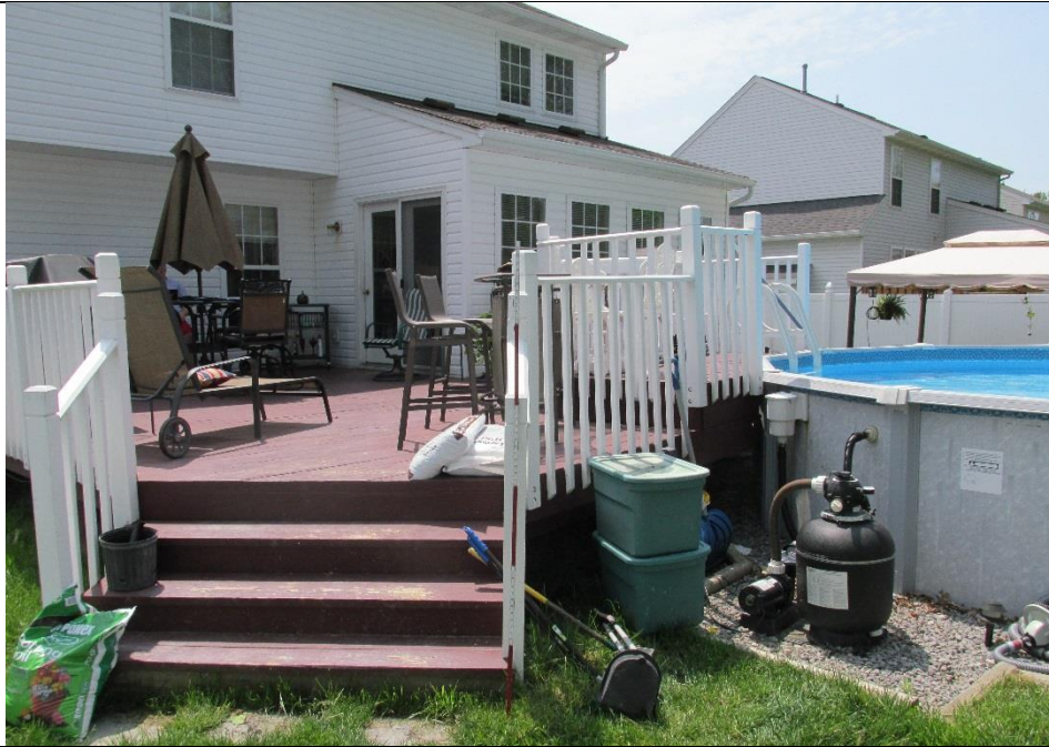
LOCATION- REAR OF HOME DESCRIPTION- EXISTING DECK TO BE REMOVED; APPROXIMATE LOCATION OF NEW ADDITION