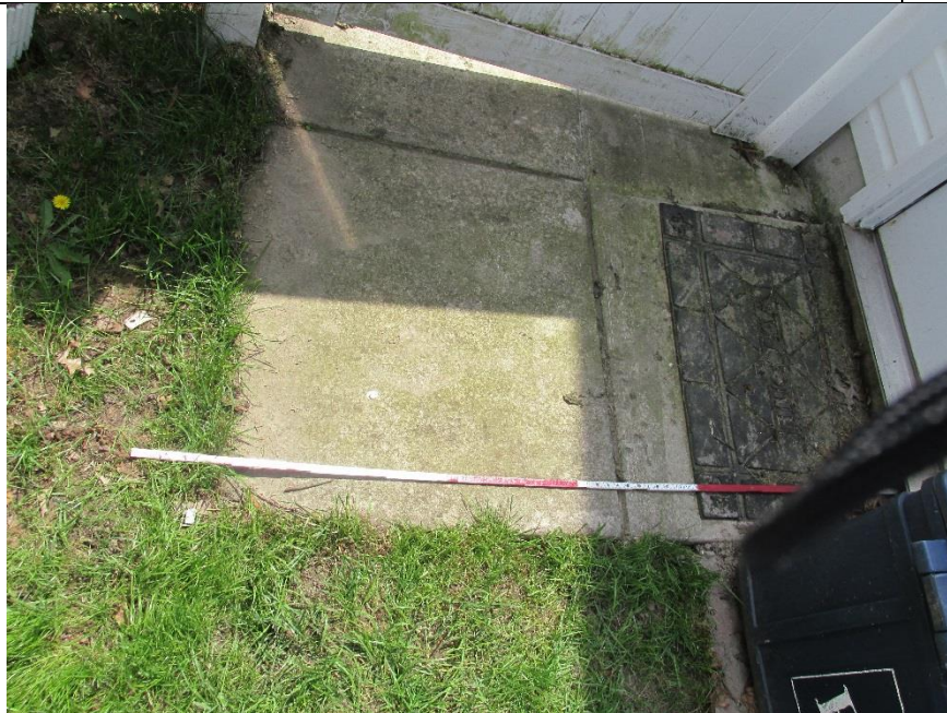
LOCATION- EAST SIDE YARD DESCRIPTION- EXISTING CONCRETE TO REMAIN AND INTEGRATED WITH NEW WALK