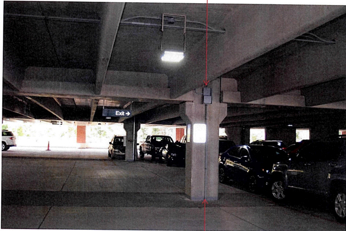
Level C | Column Mark C-15