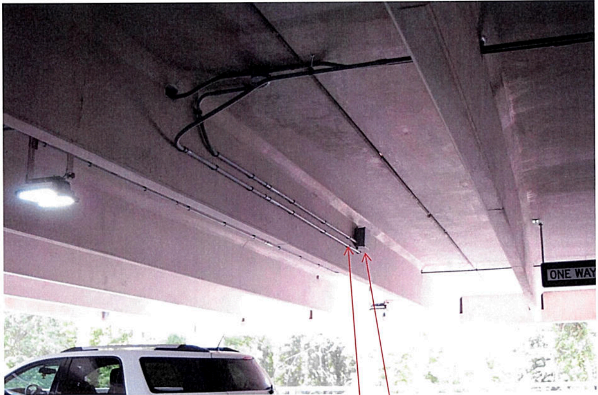
Level C | Typical Double Tee

Typical PVC junction box and PVC conduits.