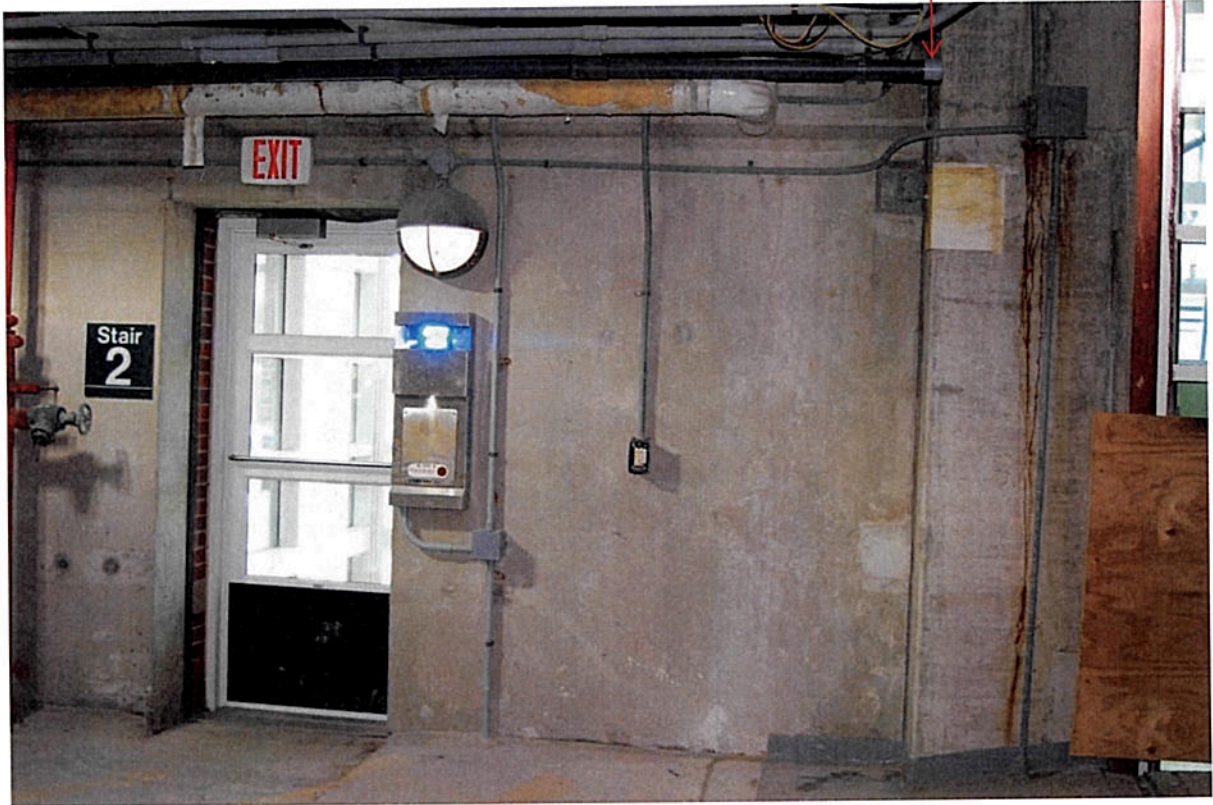
Level C | Stair 2 Existing PVC Conduit Feeder

Existing PVC conduit feeder routed to Level A Existing Electric Room – 1995 Parking Garage. Refer to drawing E-201.