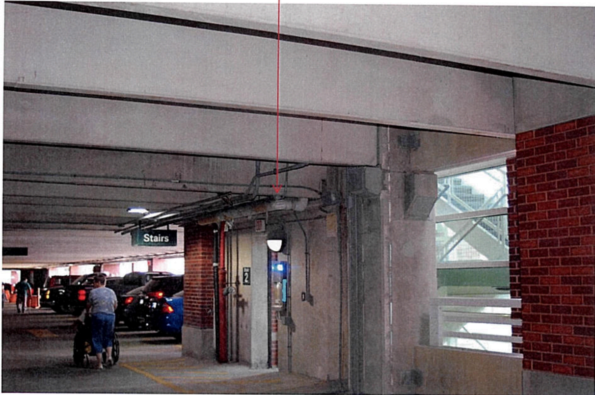
Level C | Stair 2 Existing PVC Conduit Feeder

Existing PVC conduit feeder routed to Level A Existing Electric Room – 1995 Parking Garage. Refer to drawing E-201.