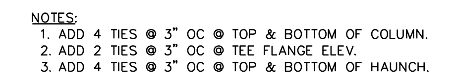
3 LIGHTWALL REINFORCING DETAIL SCALE: 1/2" = 1'-0"