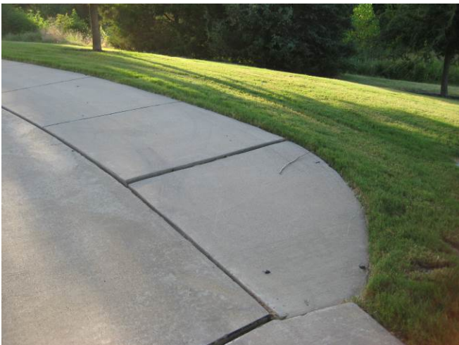
Figure 5: Sidewalk at Shelter (beginning)