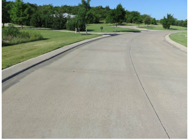
Figure 2: Lone Star Circle (typical joint layout).