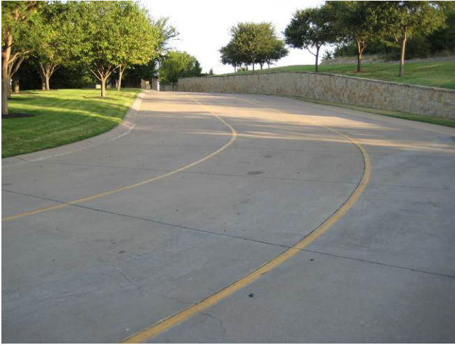
Figure 7: Shelter Drive (typical joint layout).