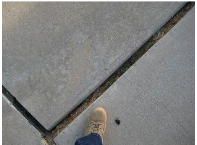
Figure 6: Example of extra wide joint (from Figure 5)