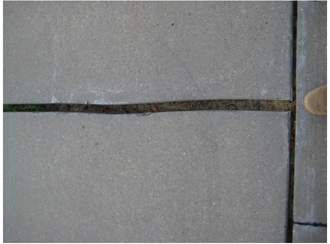
Figure 8: Example of extra wide transverse joint at Shelter Drive (boot on right for scale)