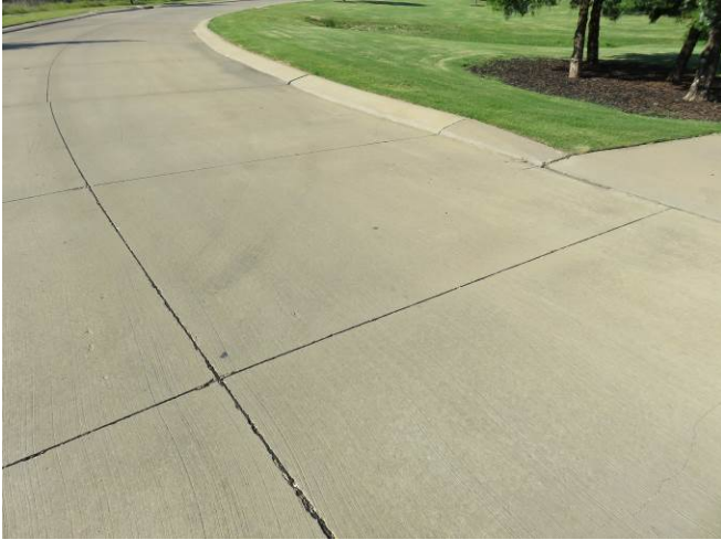
Figure 1: Patriot Ave. (typical joint layout).