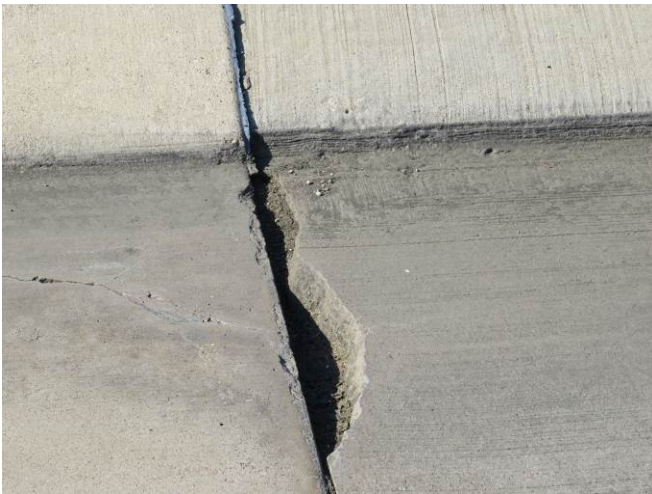
Figure 3: Example of spall near joint.