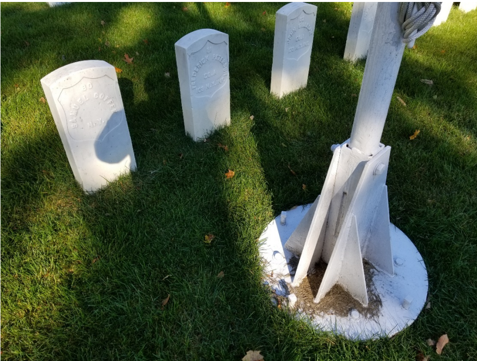
Figure 2: Picture showing the existing flagpole base and the encroachment on the existing burial areas.