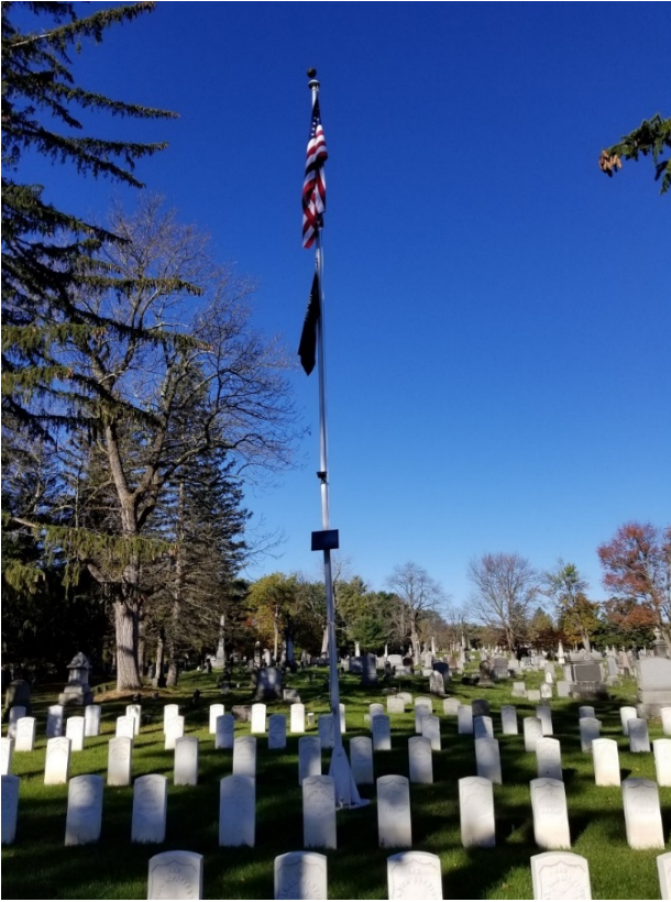
Figure 1: Picture showing the existing flagpole.