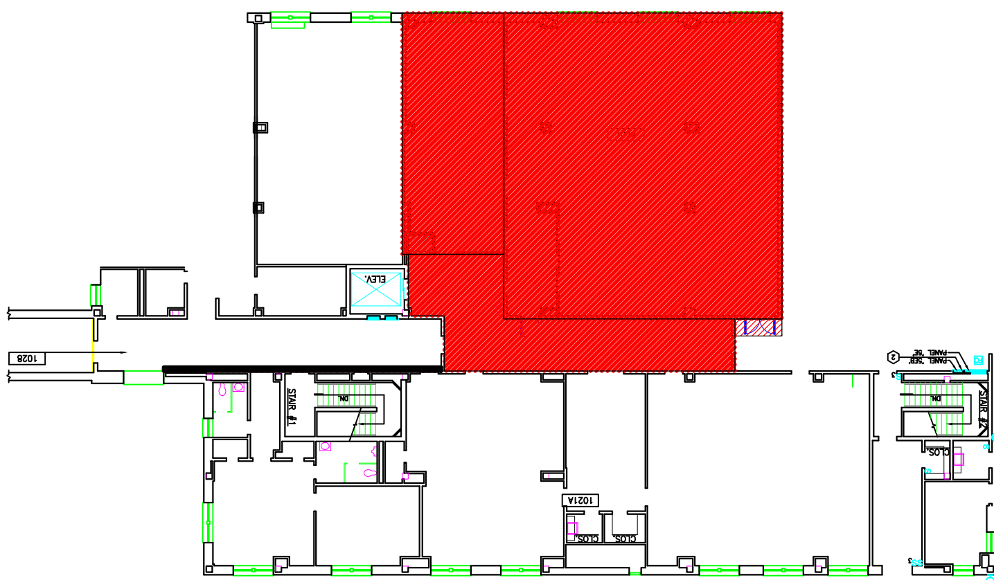
KEY PLAN BUILDING 5 OFFICE SPACE RENOVATION