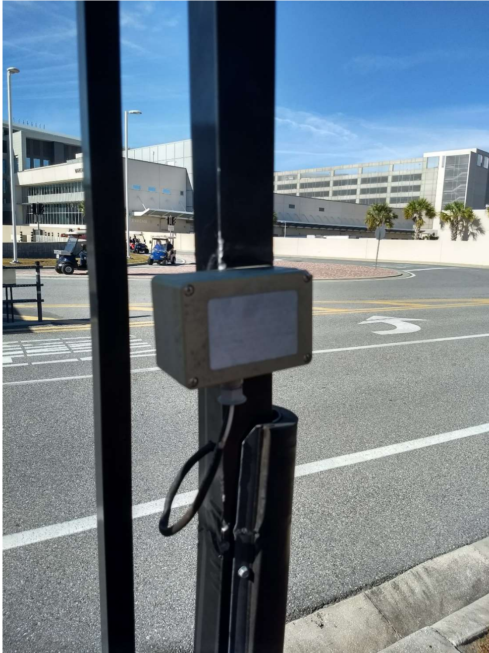
Figure 2 Damaged Safety Edge