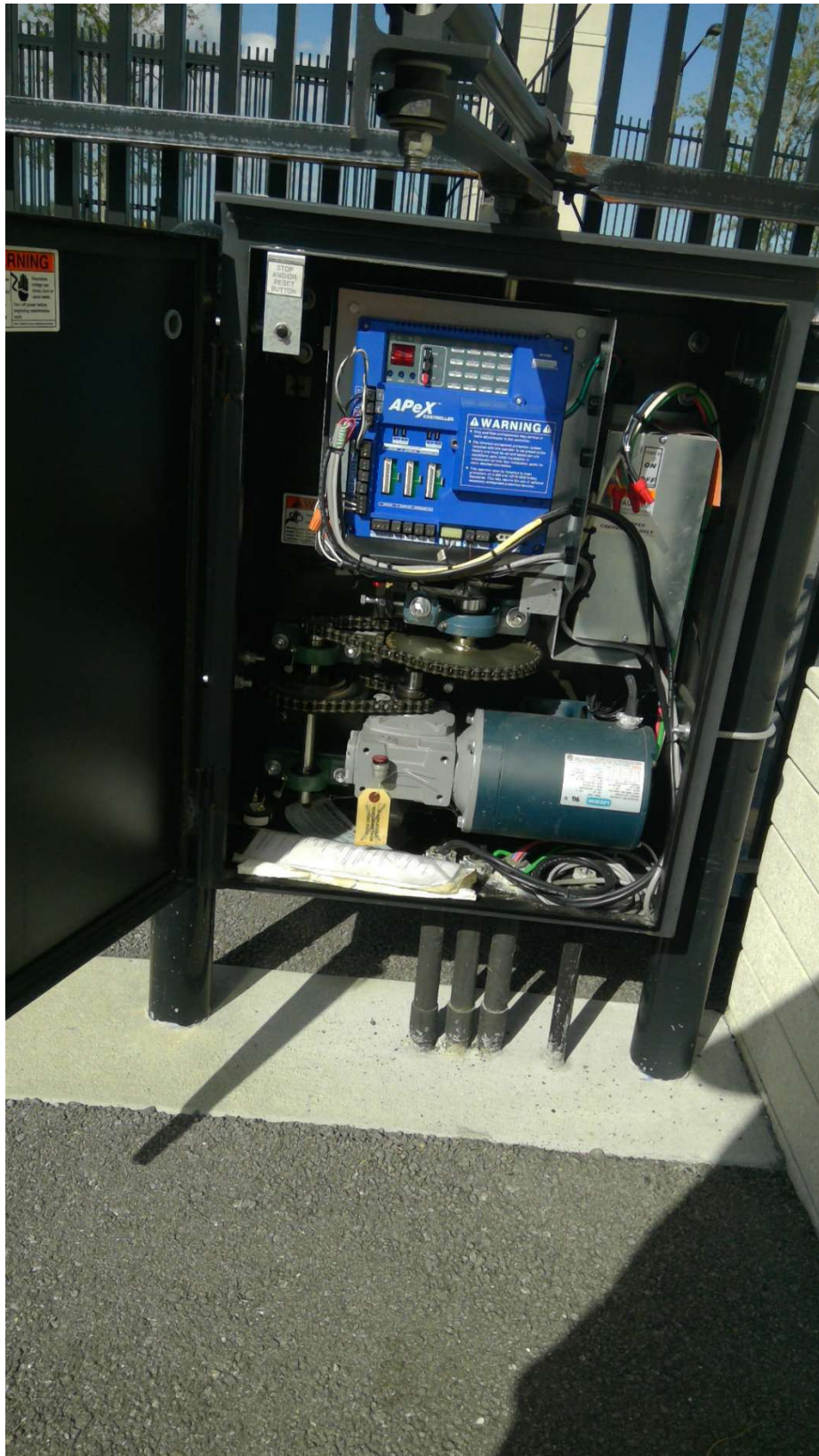
Figure 1 Swing gate operator