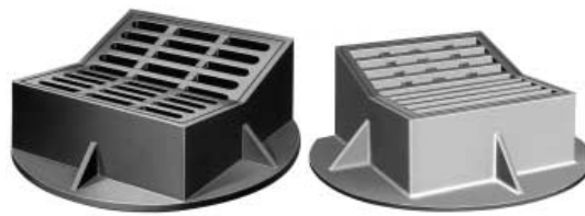
Inlet Frames and Grates for Driveway and Mountable Curb