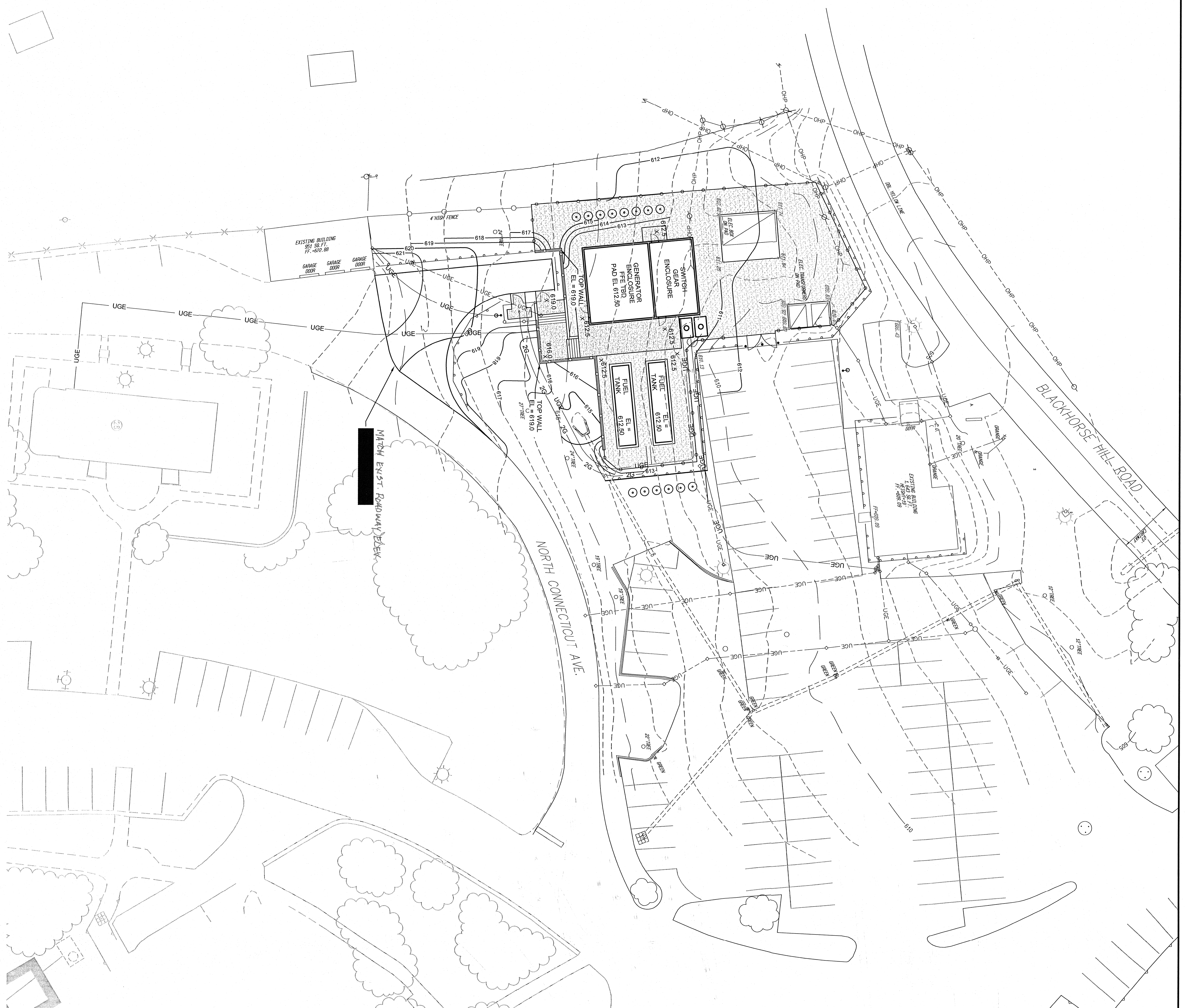
1 GRADING PLAN SCALE 1" = 20'