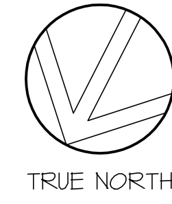
1/8" = 1'-0"

I. ALL LIGHT FIXTURES SHOWN TO BE REMOVED SHALL BE DEMOLISHED BACK TO NEAREST JUNCTION BOX.