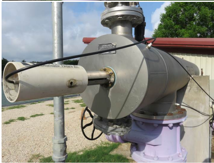
Figure 4: Tekleen filter system