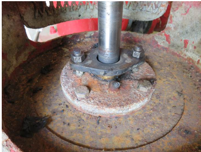
Figure 7: West pressure maintenance pump motor shaft Figure 8: West pressure maintenance pump packing to be replaced