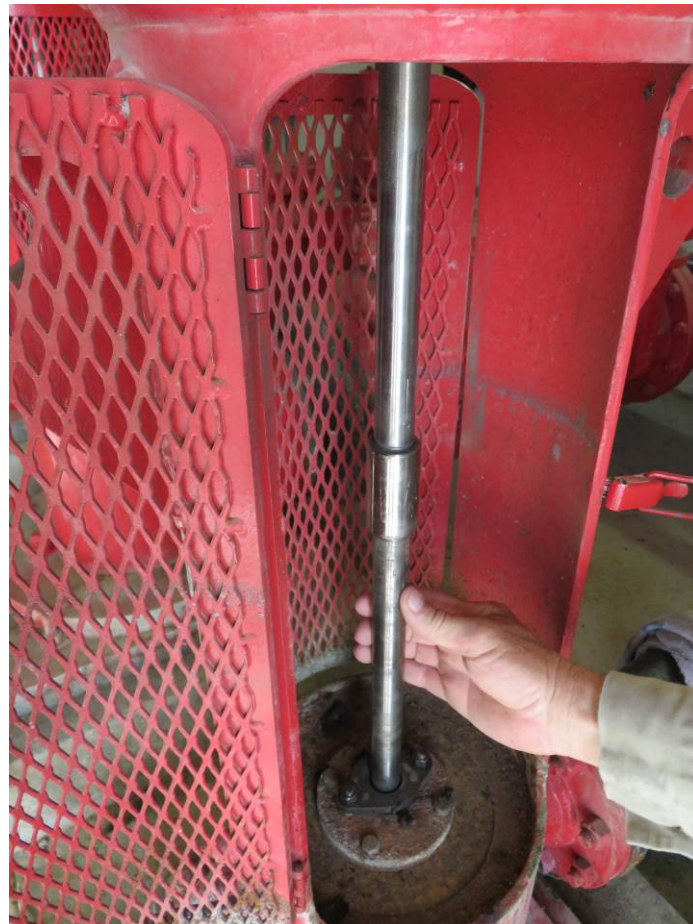
Figure 6: Tekleen filter system