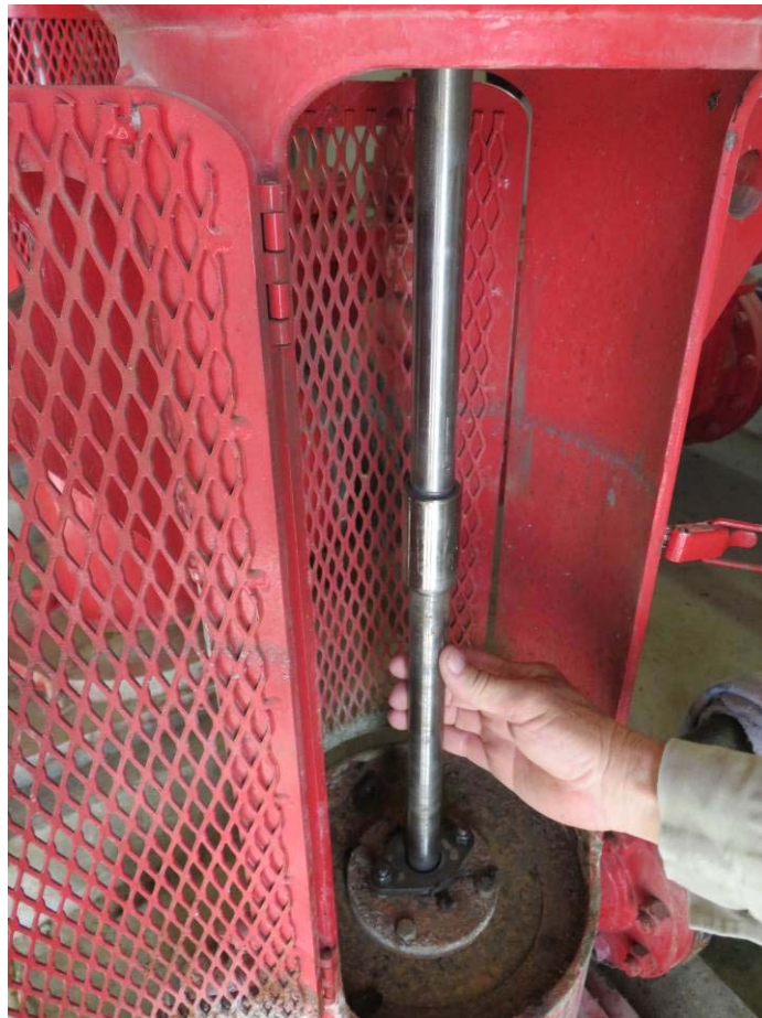
Figure 6: Tekleen filter system