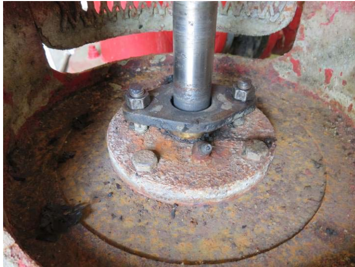
Figure 7: West pressure maintenance pump motor shaft Figure 8: West pressure maintenance pump packing to be replaced