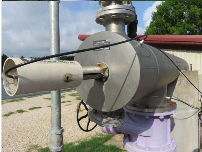
Figure 4: Tekleen filter system