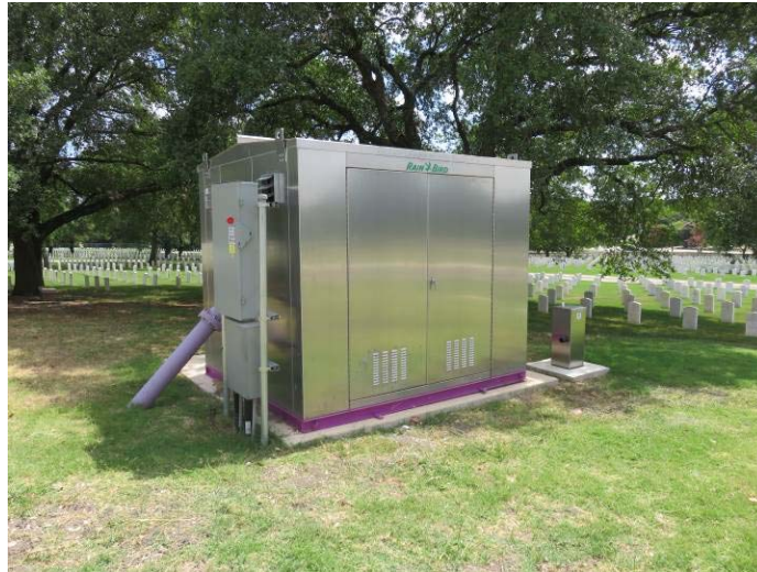
Figure 1: West Pump Station