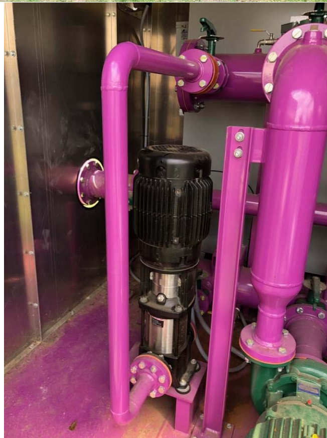
Figure 2: West pump jockey motor