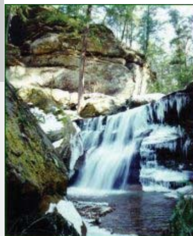
The Hocking Hills Geological History on Display