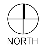
1 SECOND FLOOR EAST MECHANICAL PIPING PLAN AREA B 1/4" = 1'-0"