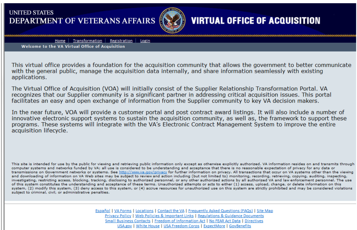
Figure 1: Home Page