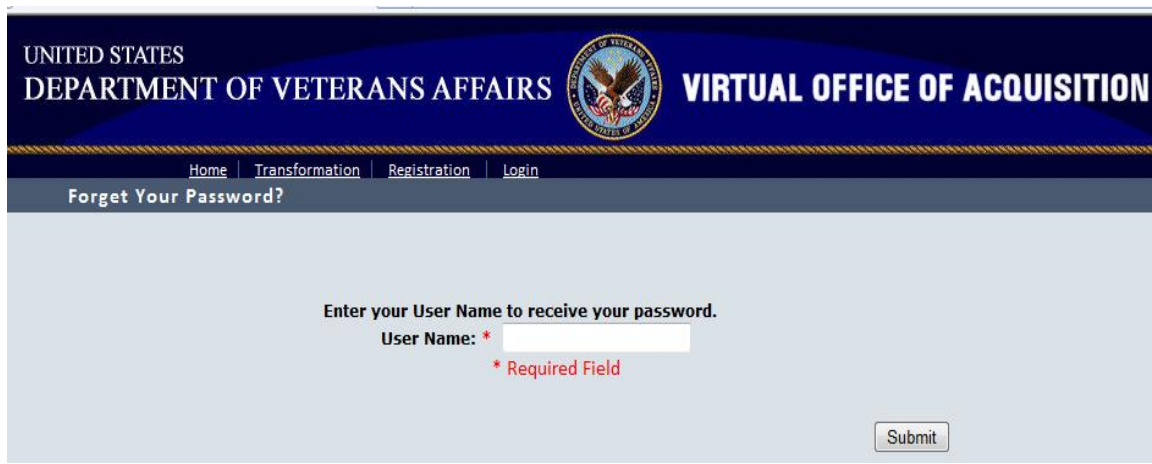
Figure 6: Forgot Password