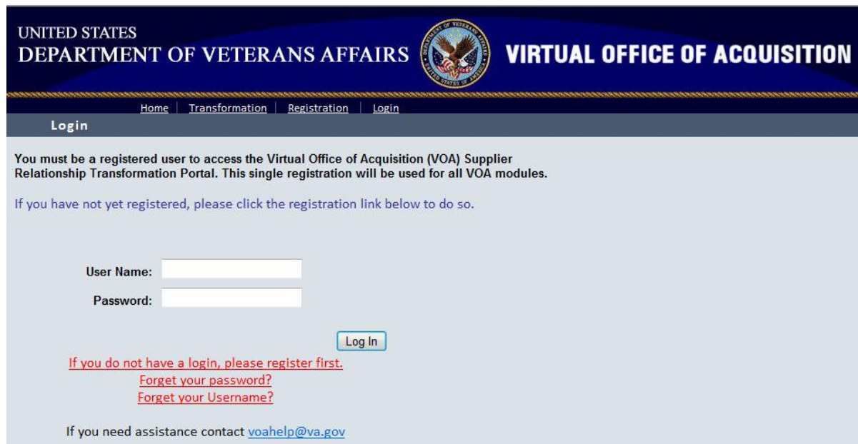
Figure 5: Login page