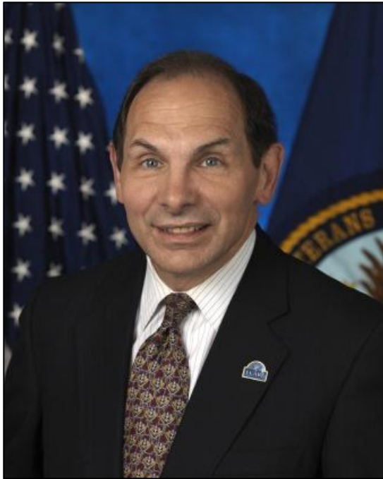
Secretary Robert A. McDonald

“.....it is critical that all of us at VA reaffirm our commitment to our mission and our values. Our commitment to serving Veterans must be unquestioned. Veterans must know that we are “all in” when it comes to accomplishing our mission and living by our values.