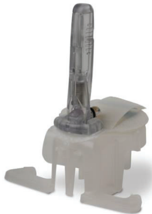
Enlite™ Sensor (5 pack) Product Code: MMT-7008A