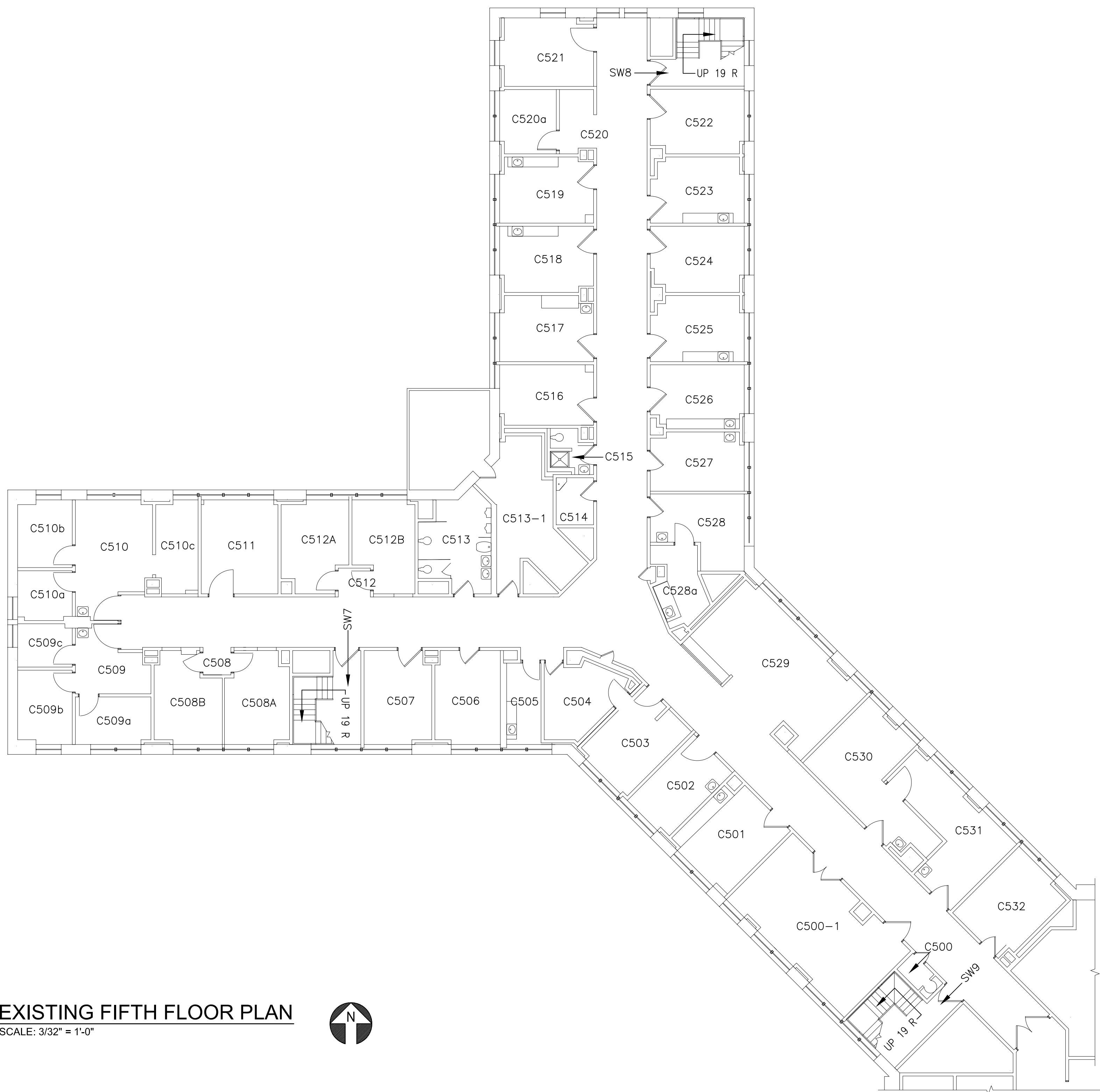
1 KP100 EXISTING FIFTH FLOOR PLAN SCALE: 3/32" = 1'-0"