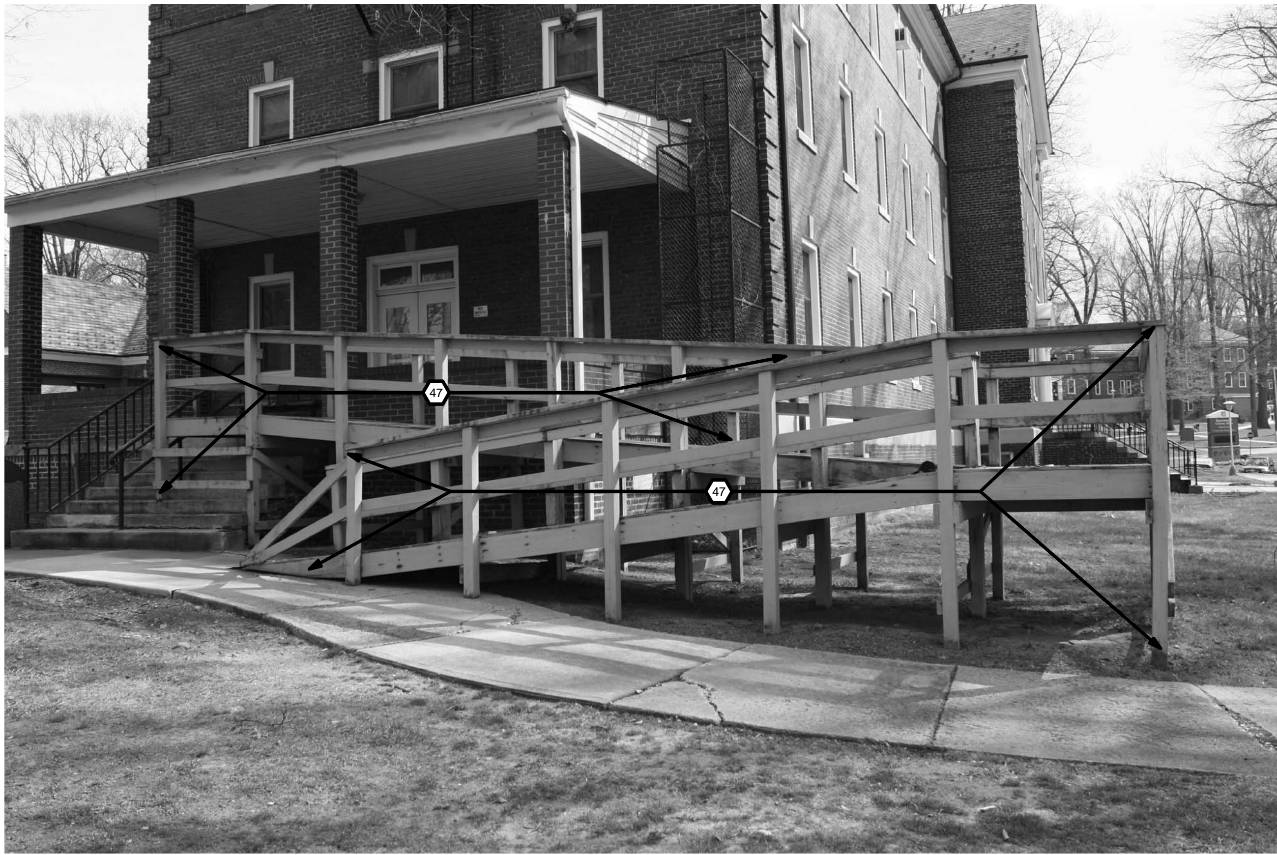
③ Building 16 - Ramp 3 N.T.S.