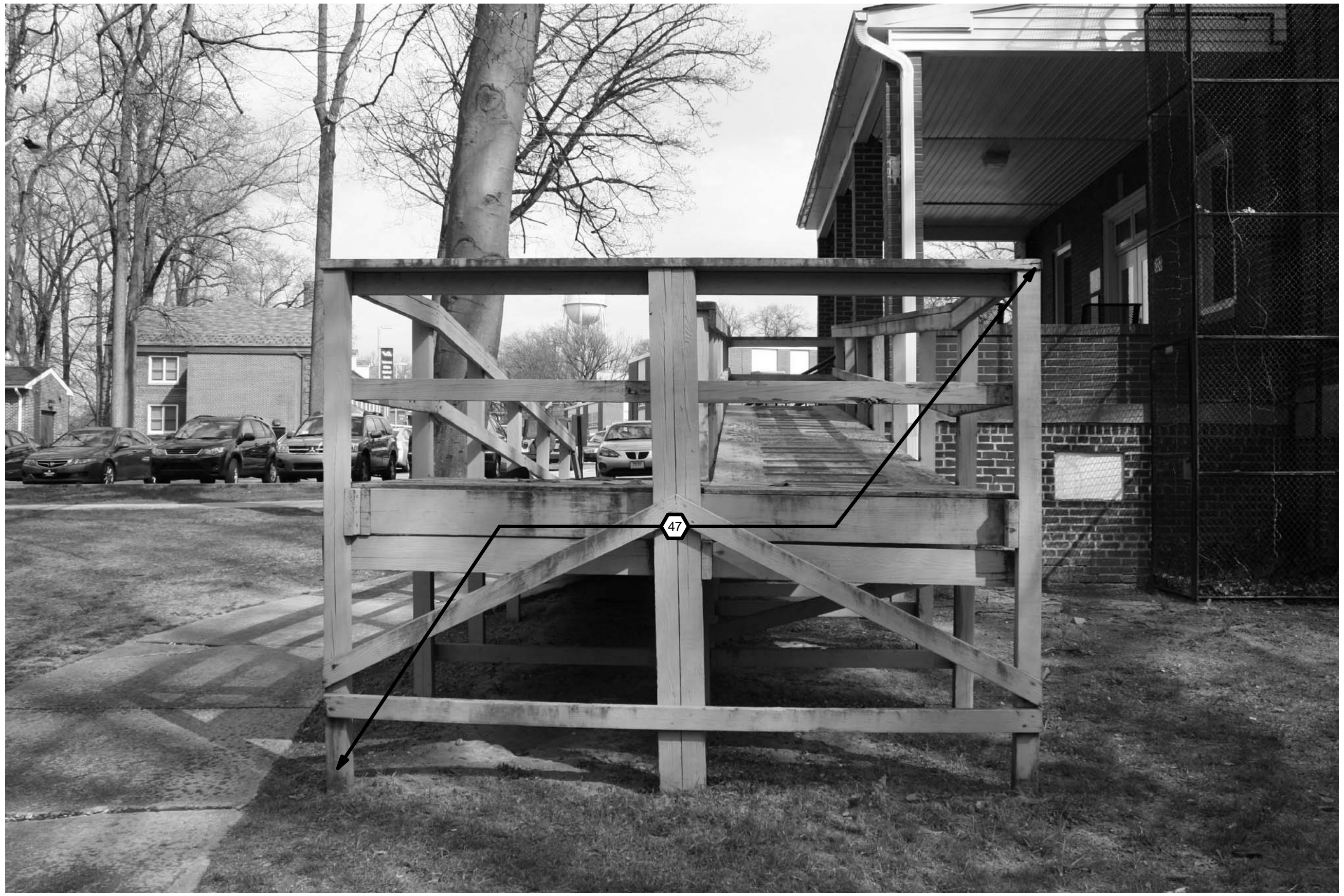
② Building 16 - Ramp 2 N.T.S.