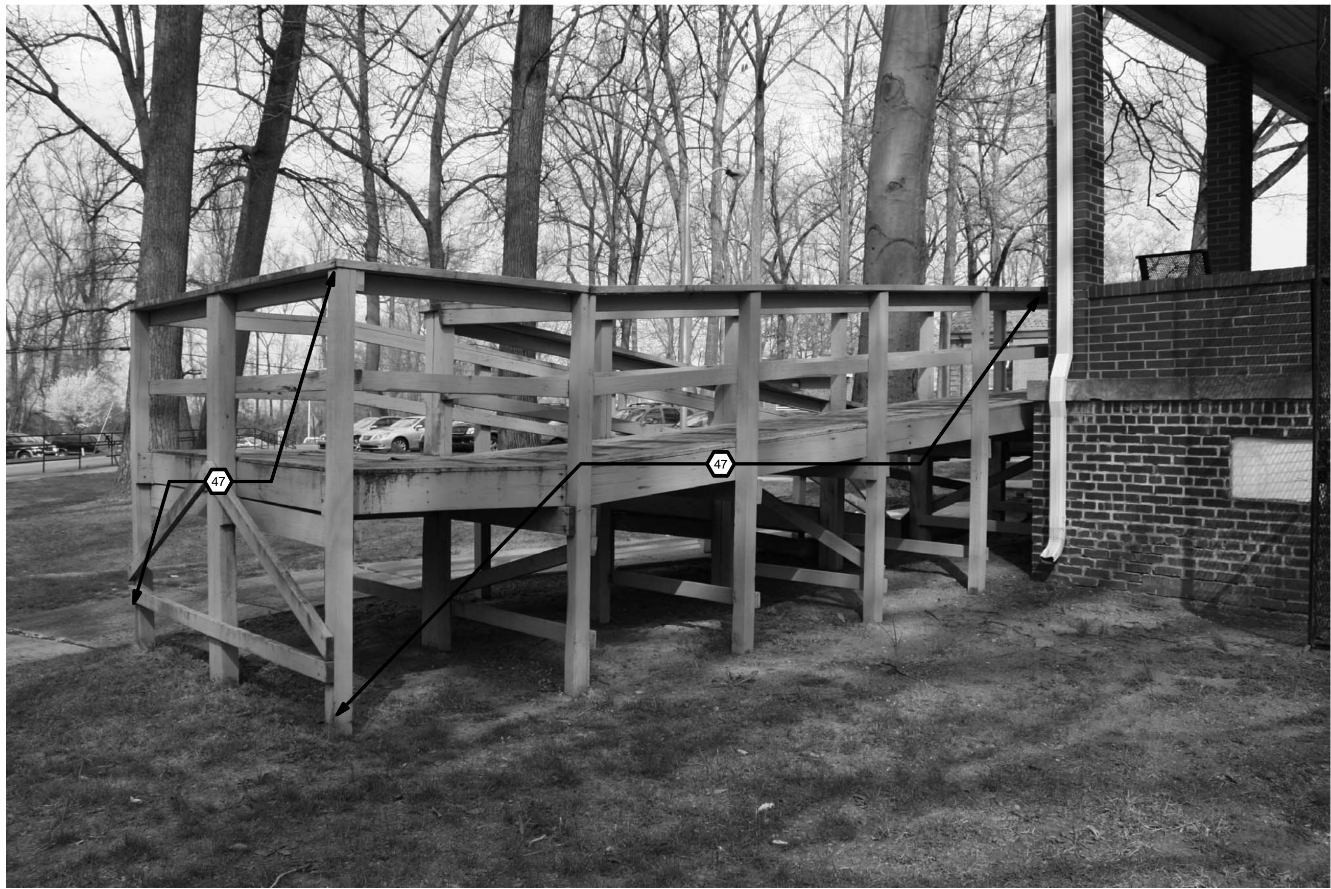
① Building 16 - Ramp 1 N.T.S.