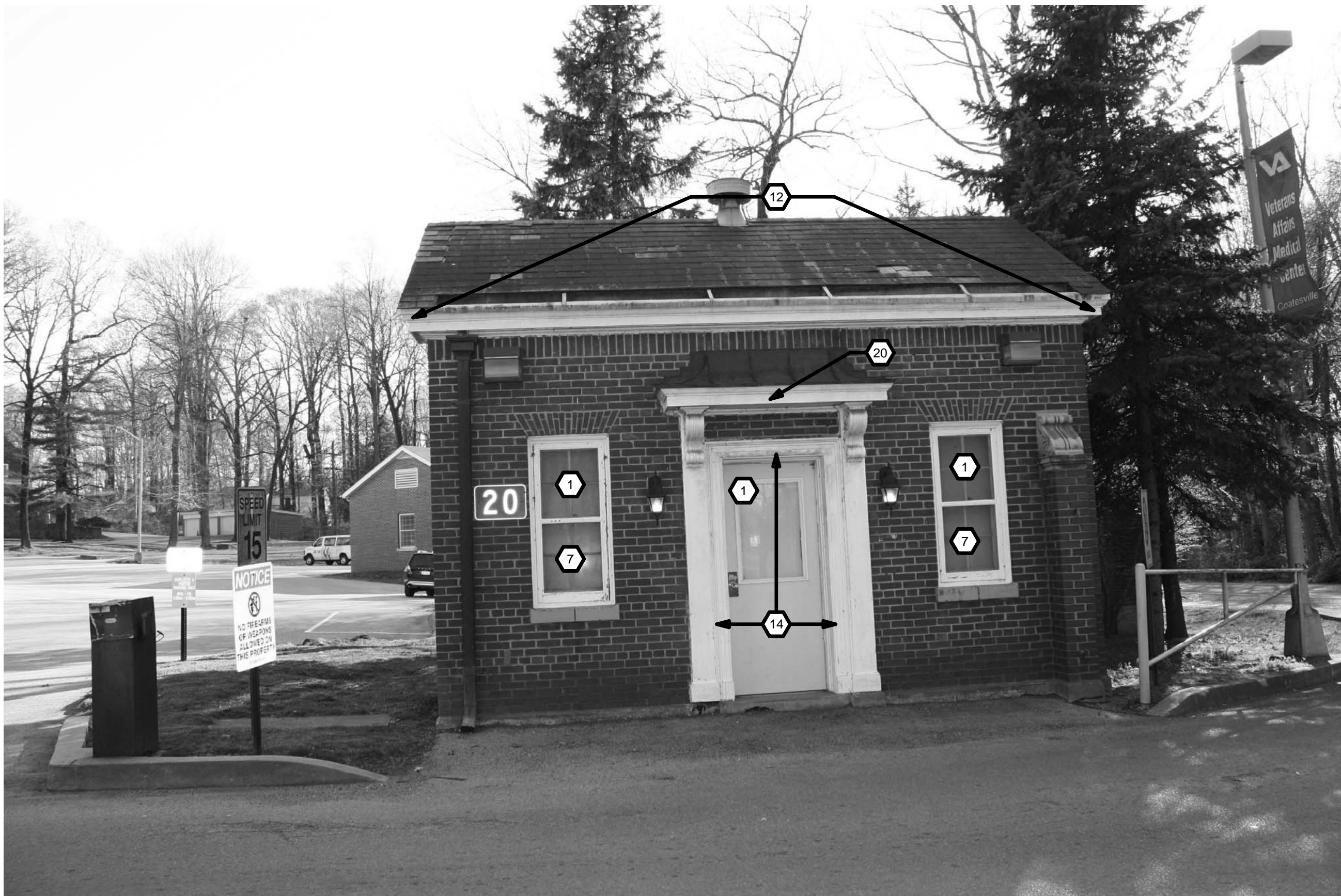
1 Building 20 - Northeast Elevation N.T.S.