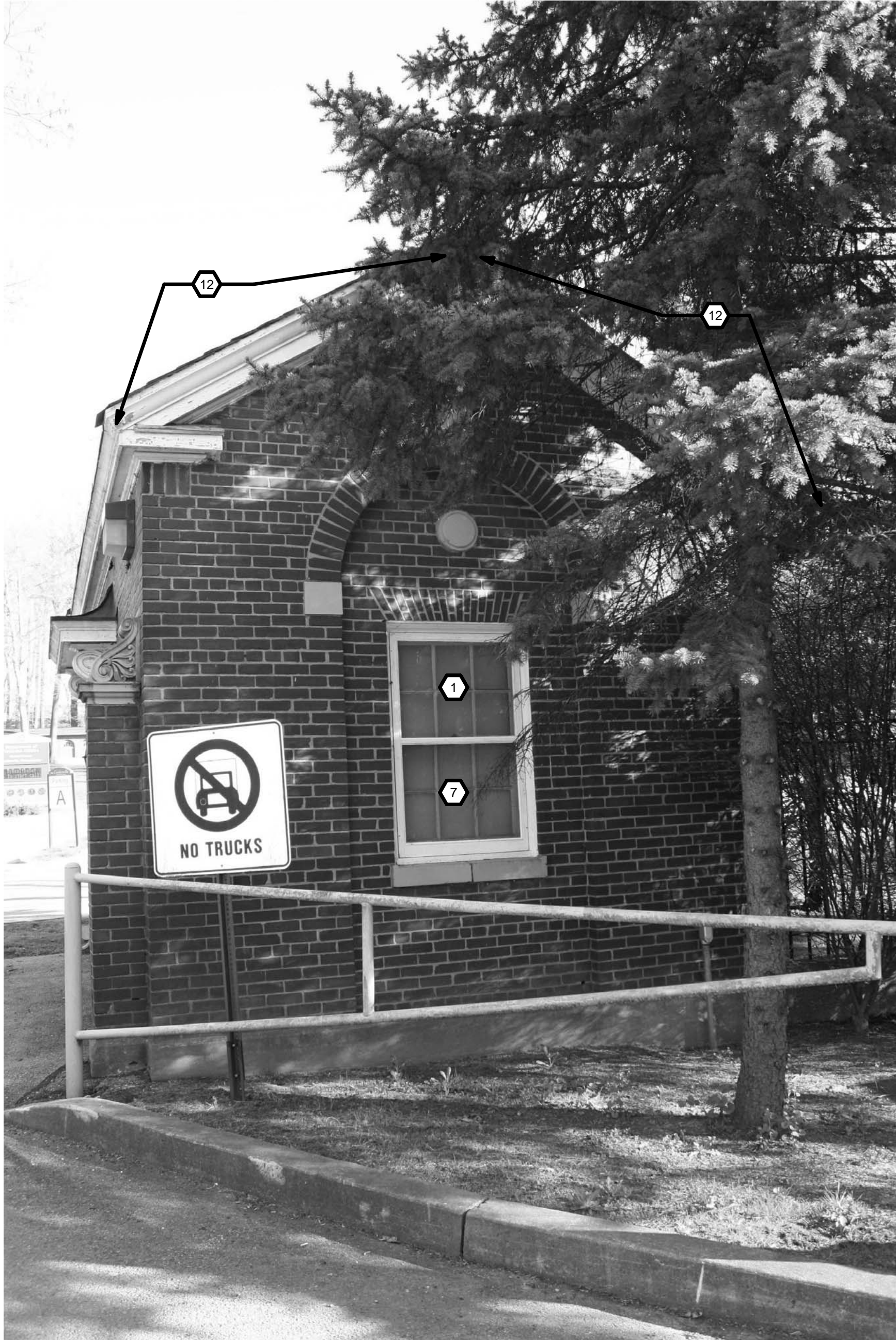
3 Building 20 - Northwest Elevation N.T.S.