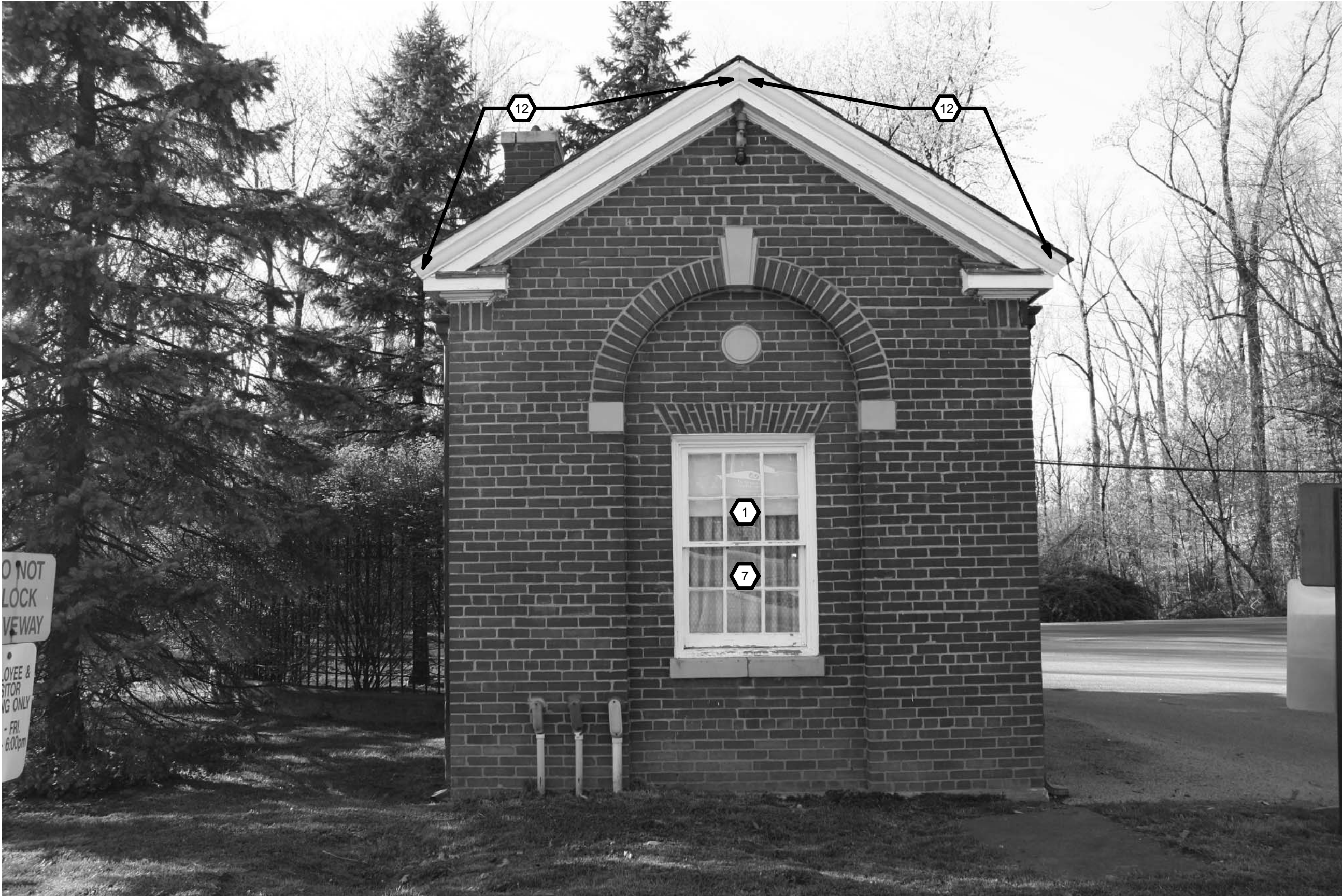
4 Building 20 - Southeast Elevation N.T.S.