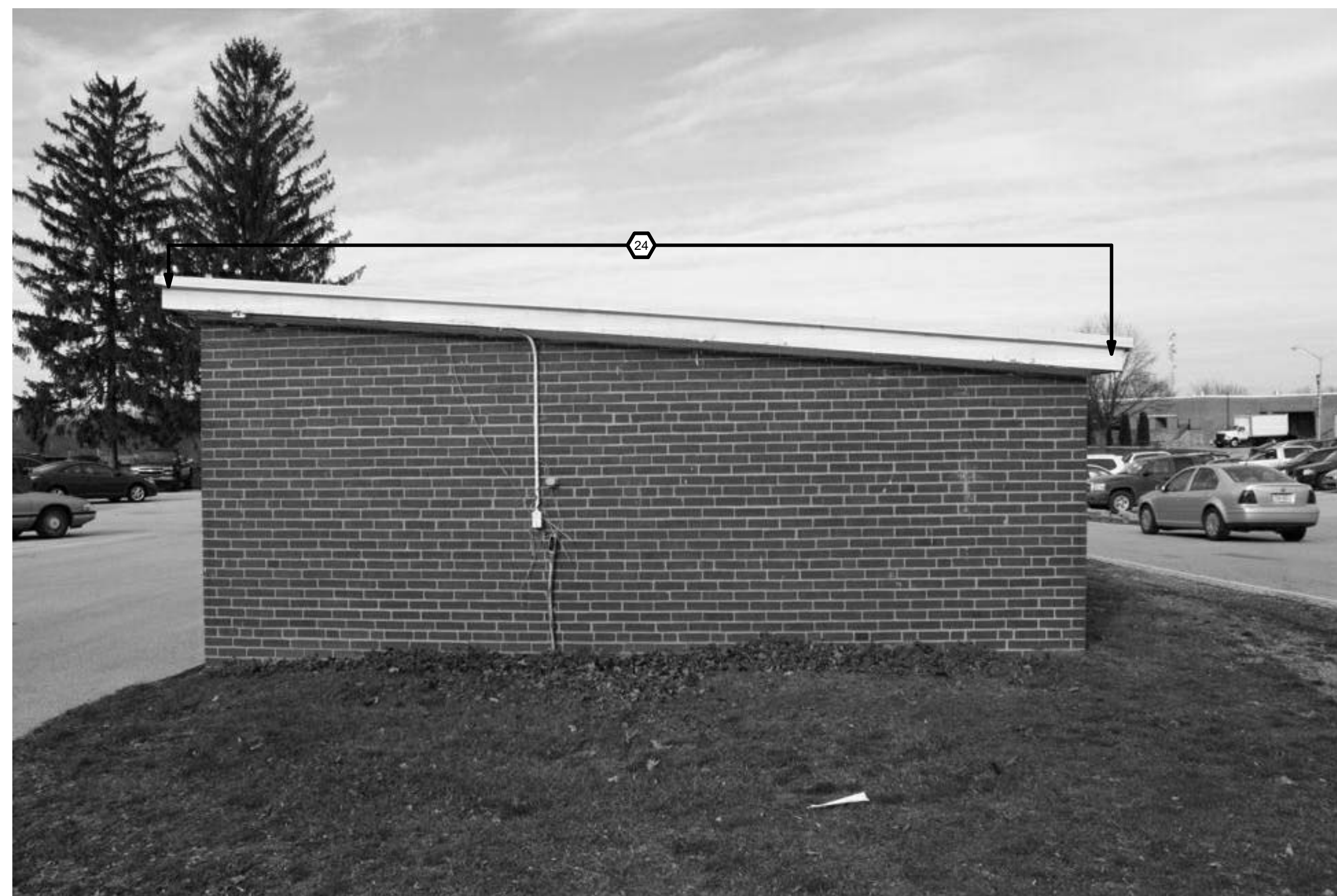
④ Building 50 - Right Elevation N.T.S.