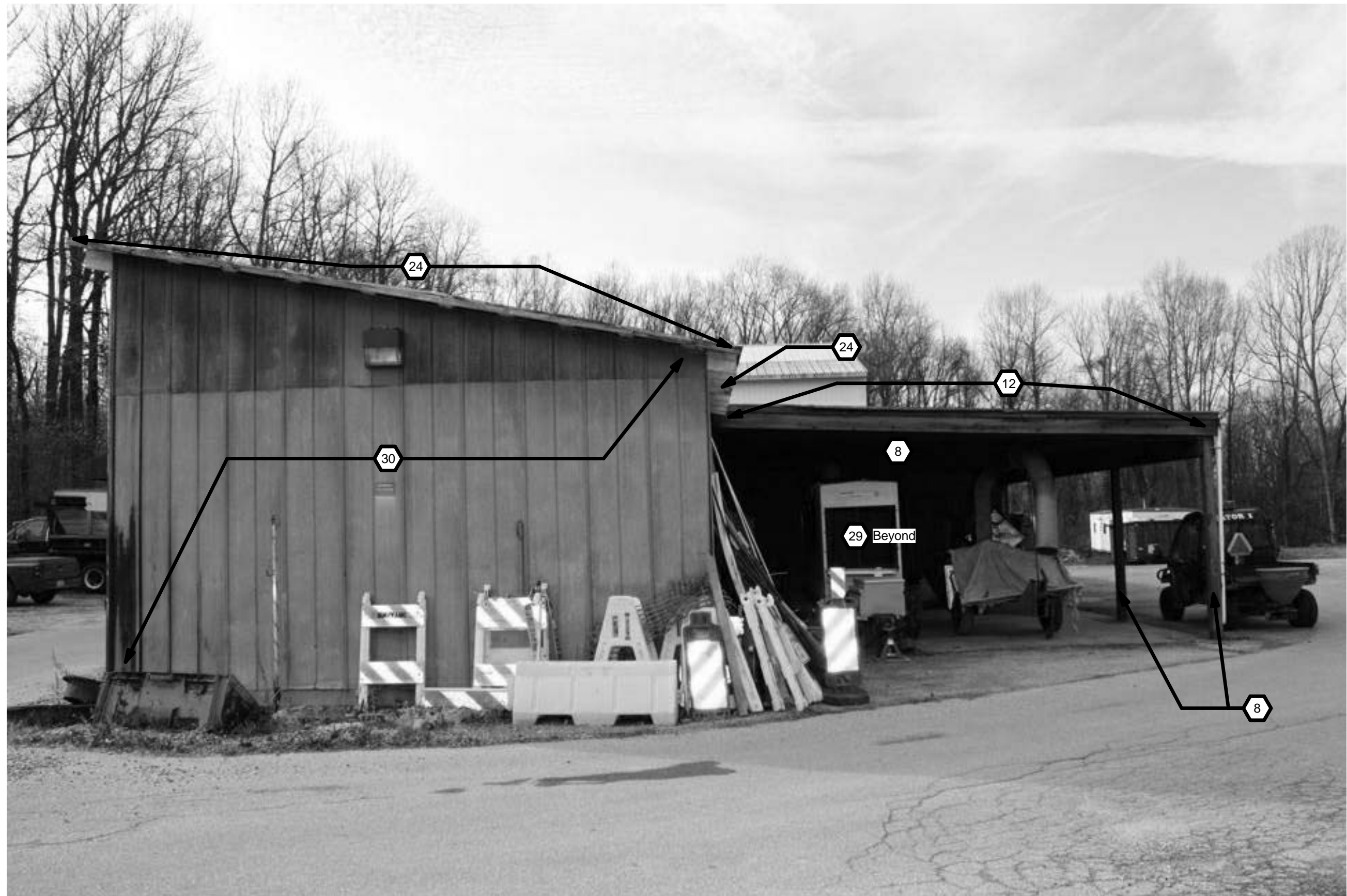
① Building T-21 - Right Elevation N.T.S.