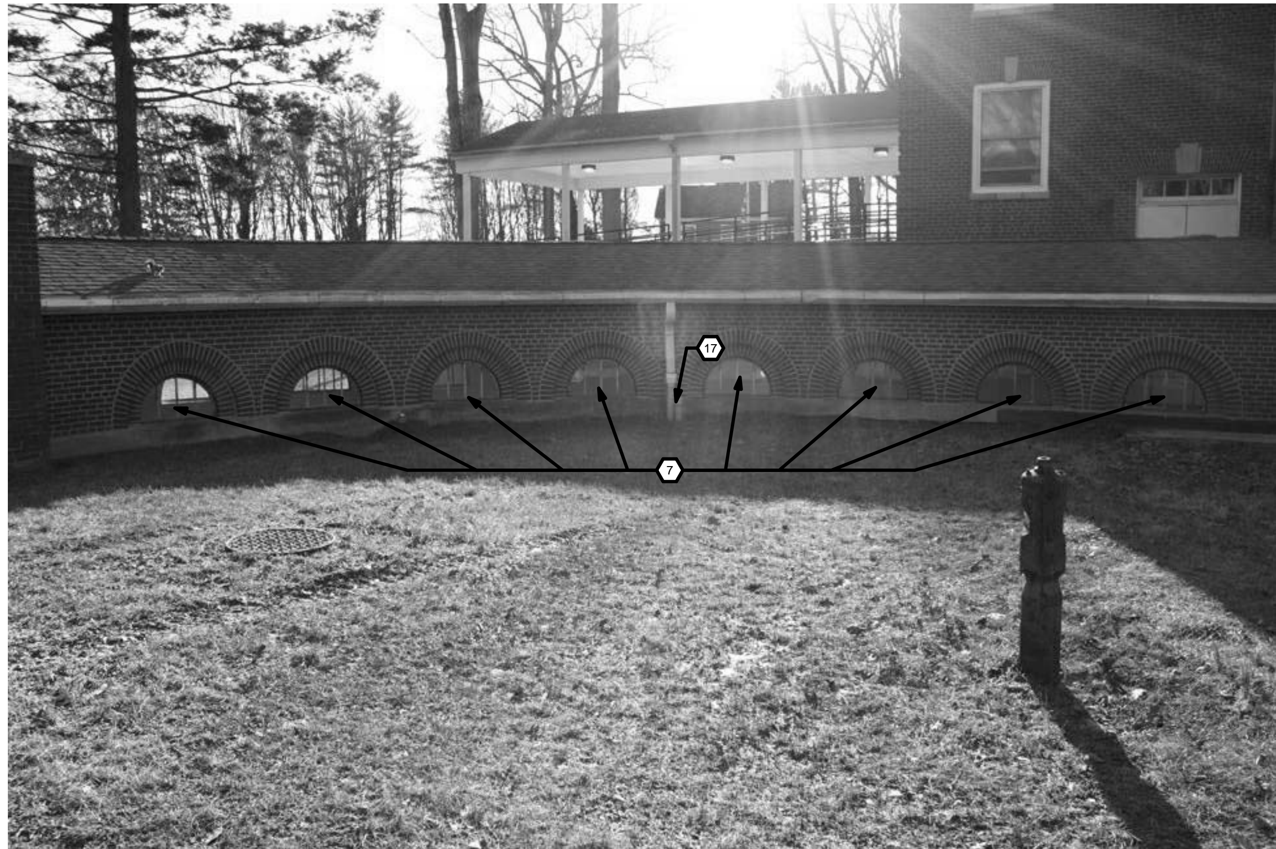
③ CC 4-5 - Inside Loop 1/32" = 1'-0"