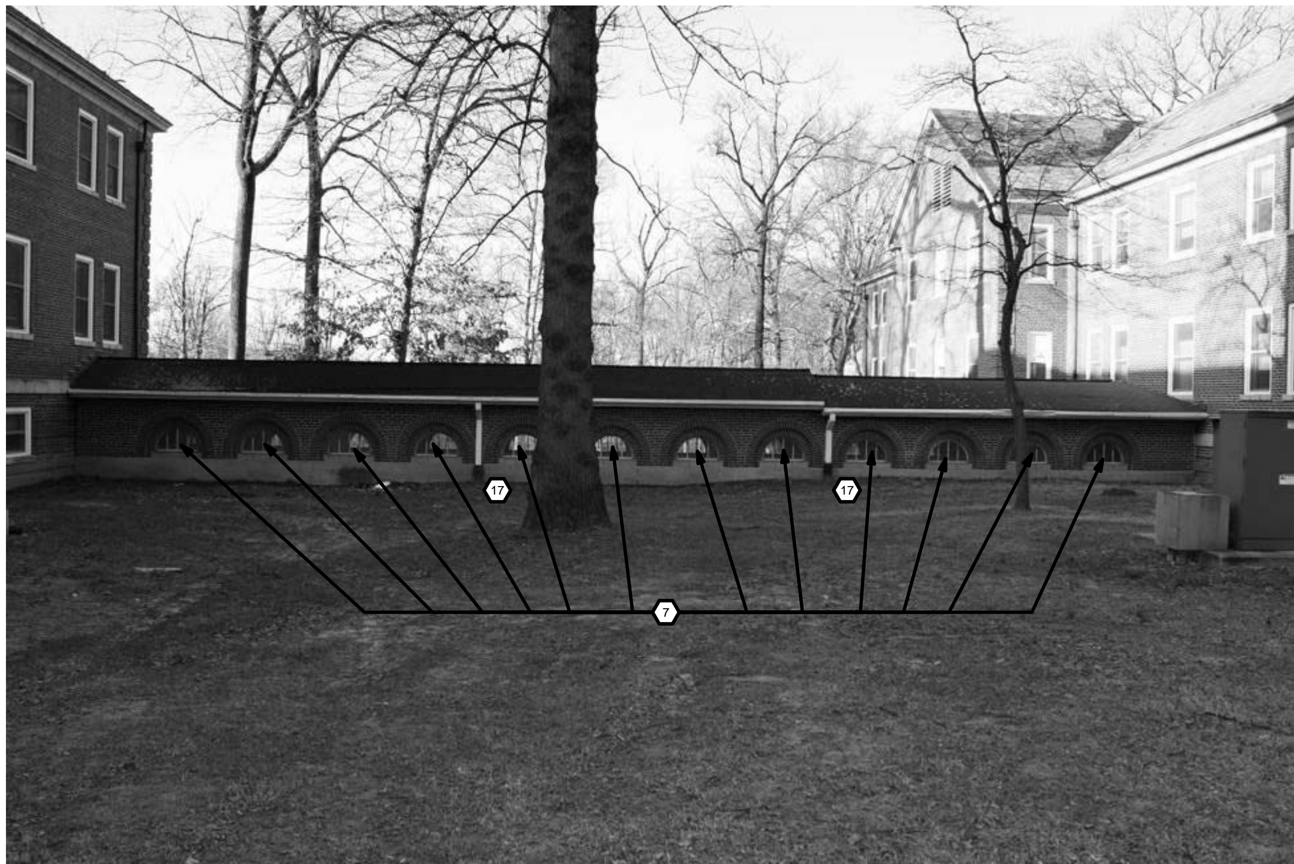
① CC 6-7 - Inside Loop 1/32" = 1'-0"