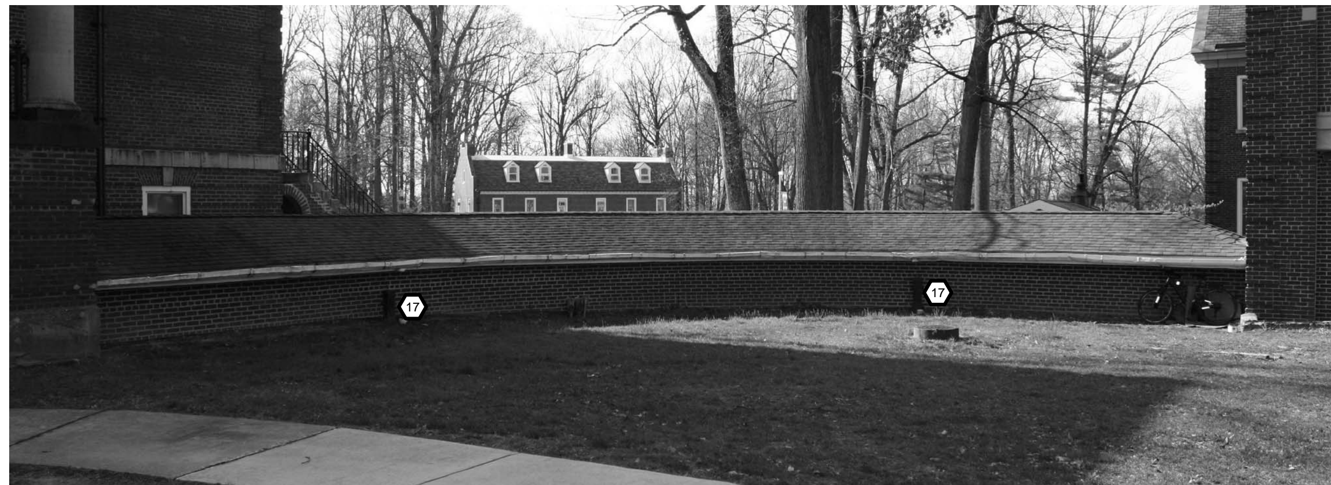
④ CC 5-6 - Inside Loop 1/32" = 1'-0"