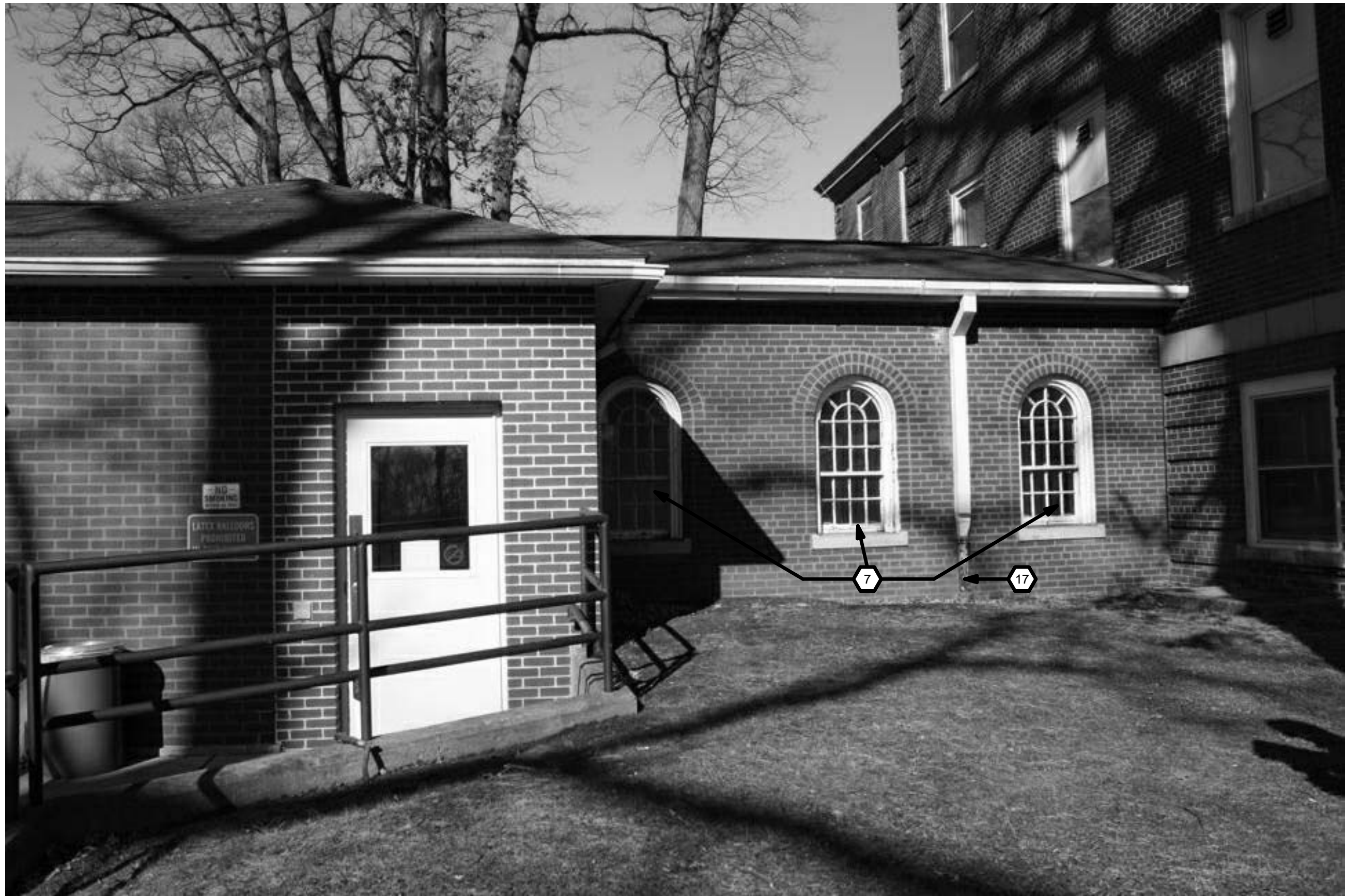
① CC 38-39 - Outside Loop N.T.S.