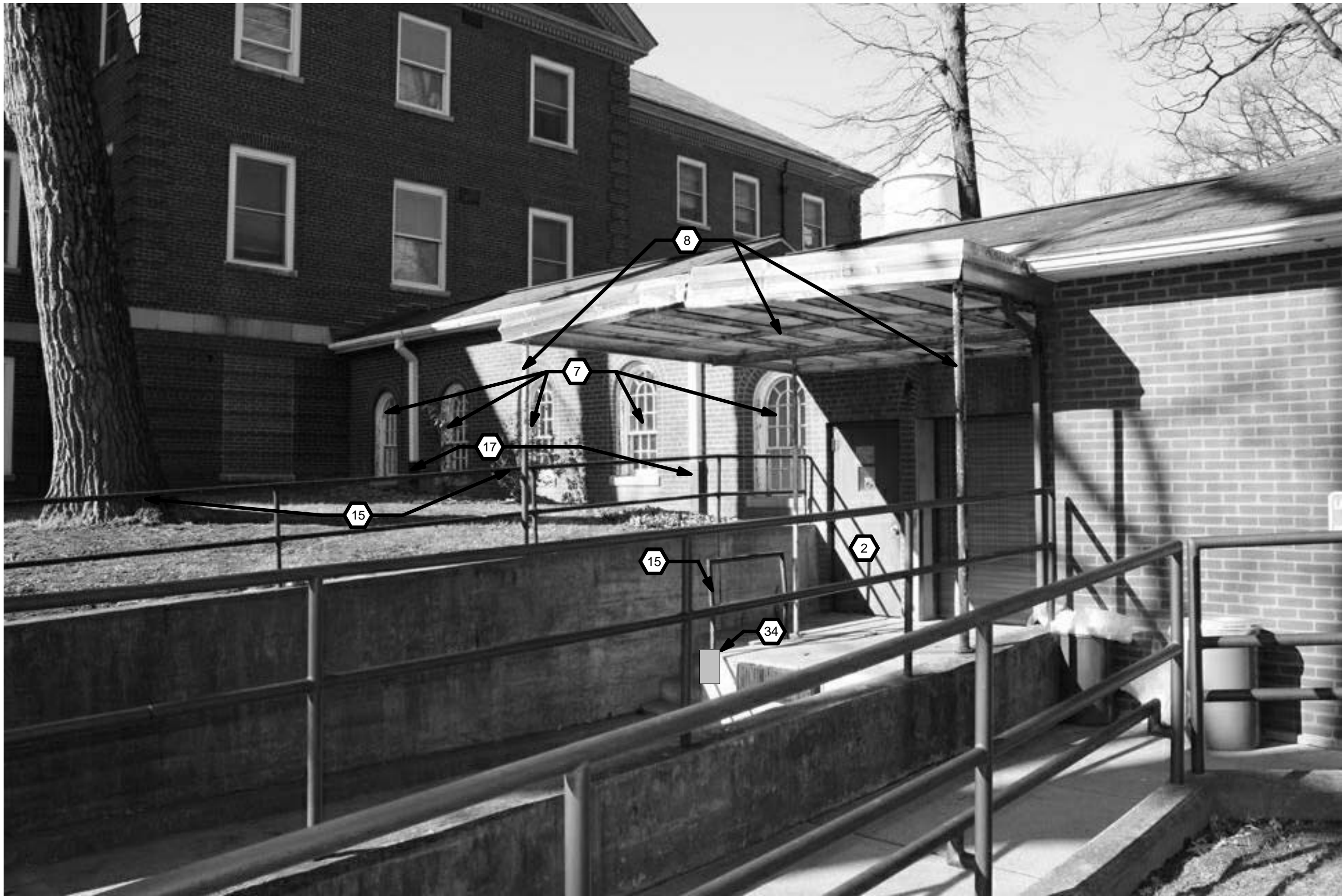
② CC 38-39 - Outside Loop 1 N.T.S.