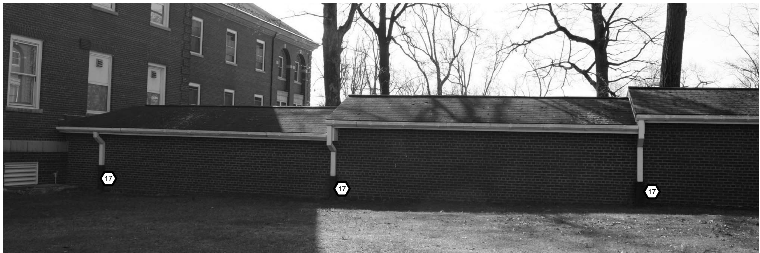
⑤ CC 38-39 -Partial Inside Loop 1 1/32" = 1'-0"