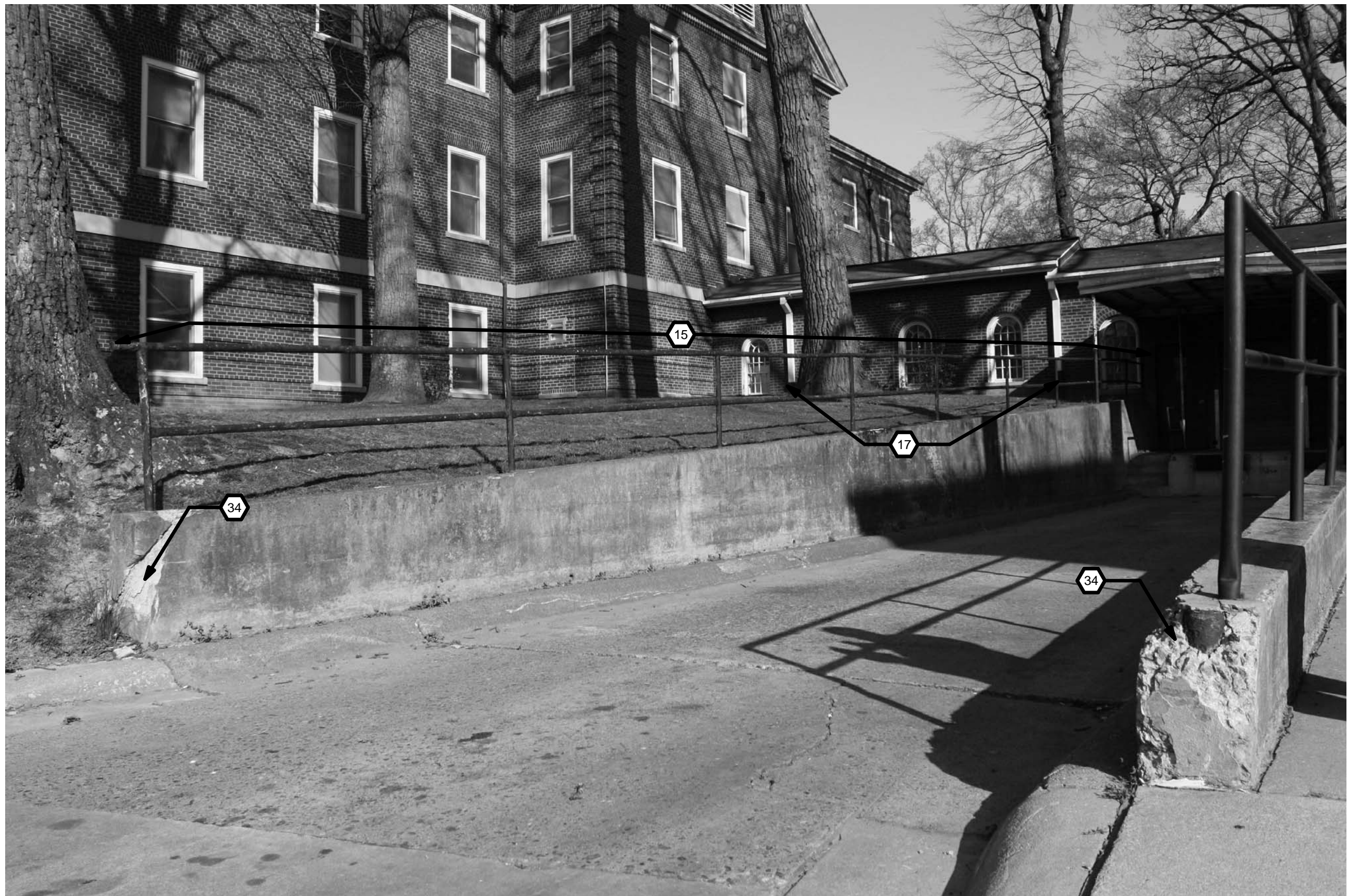
③ CC 38-39 - Outside Loop 2 1/32" = 1'-0"