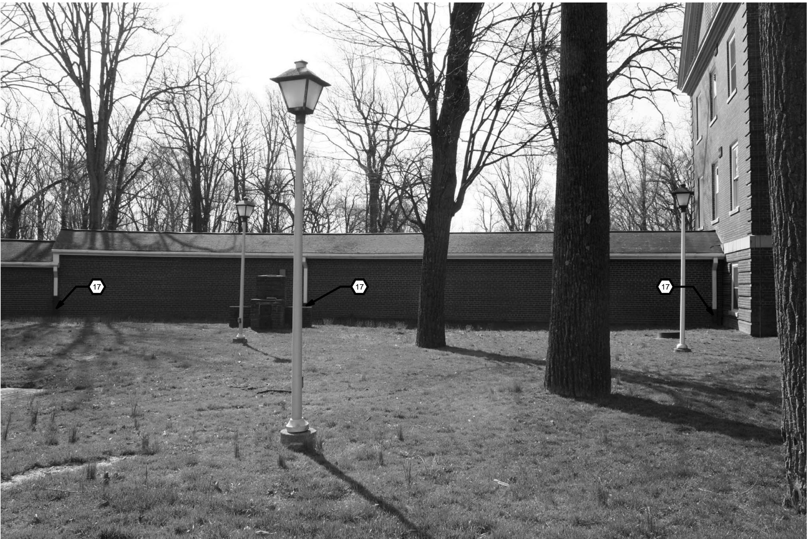
4 CC 39-57 - Partial Inside Loop 1 N.T.S.