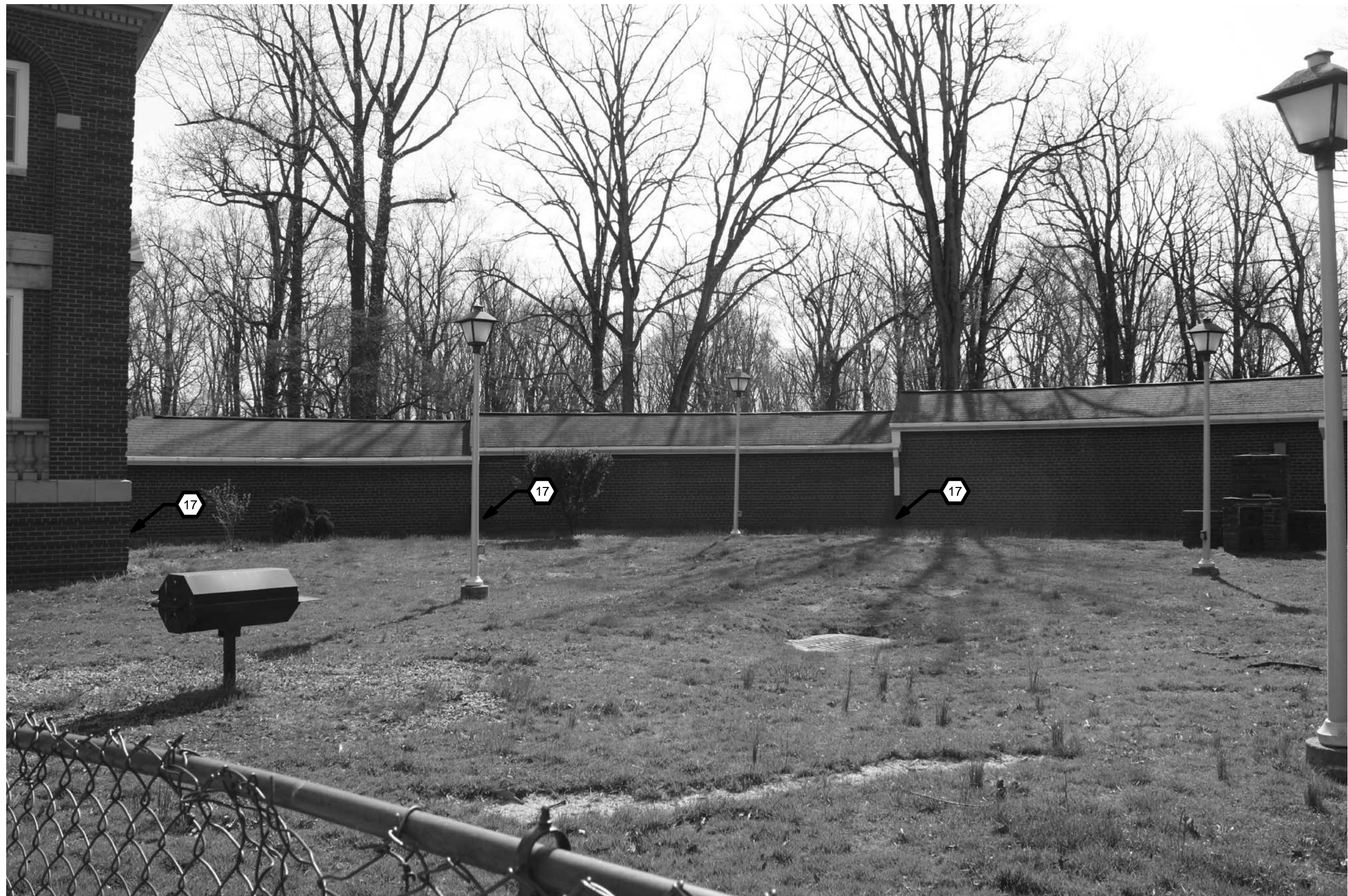
3 CC 39-57 - Partial Inside Loop N.T.S.